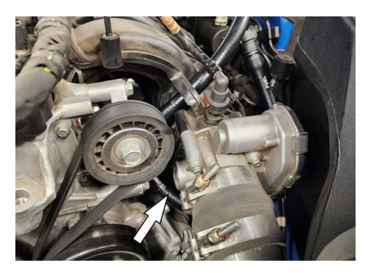
5. Connect the female 90* connector to the intake manifold. Route the hose underneath the throttlebody towards the driver's side strut tower