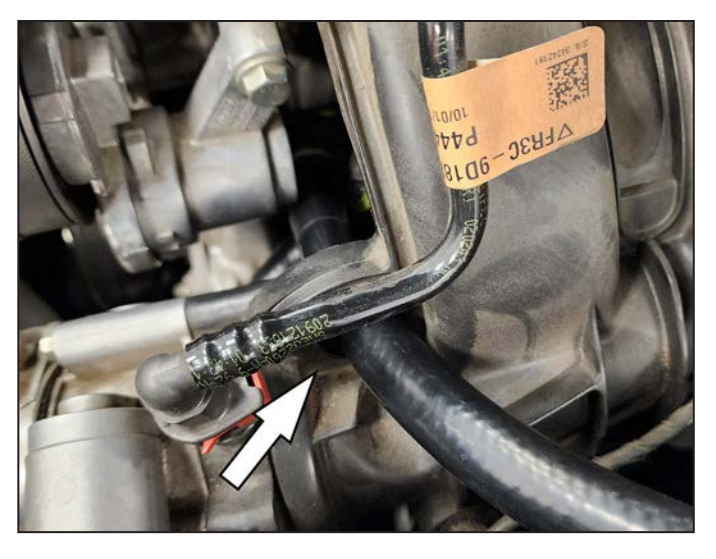
4. Install hose with male connector into OEM connector. Go through the hole in the intake manifold as shown