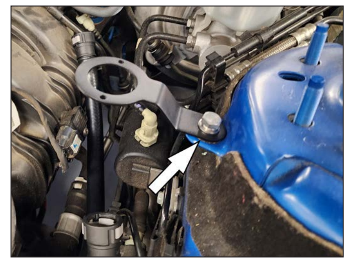
7. Install mounting bracket to strut tower tab block using M8 bolt, washer and lock washer as shown