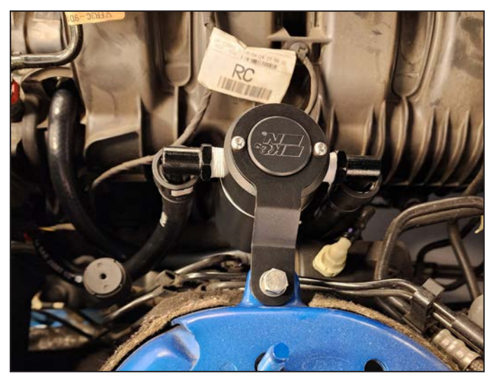
8. Mount the canister to the bracket using the two button head screws and lock washers. Ensure the K&N logo is facing as shown