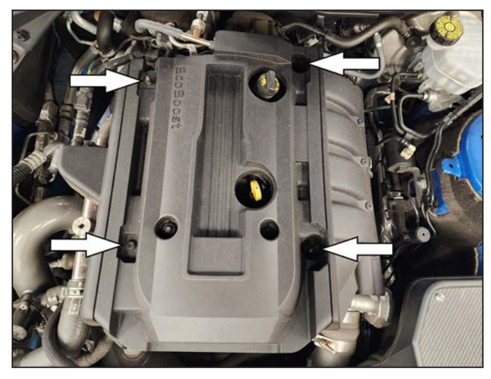
2. Remove engine cover by removing 4 bolts

1. Verify you have all the parts included in the kit.