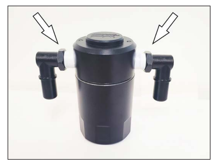
6.Assemble the quick disconnect fittings to the top of the air/oil separator. It is required to use Teflon tape on the fittings to ensure a proper seal. NOTE: DO NOT over-tighten fittings in top of oil separator