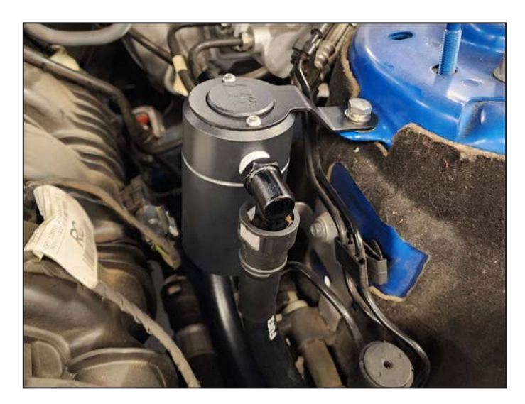
9. Install hoses on to oil separator as shown. Mount the hose with male fitting to the oil separator connector facing the rear. Mount the hose with female fitting to oil separator connector facing the front. NOTE: Lightly coat the O-Ring with oil to insert easily.