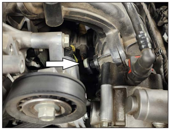
3. Remove factory PCV line by pushing button and removing it from the intake manifold. Rotate the connector slight upward