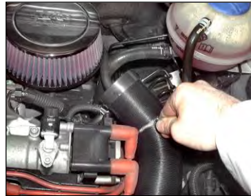
Fig. # 14