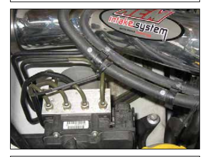
I. Secure the two rubber hoses to the steel brake tube using the supplied 6" zip-tie. Trim excess plastic.