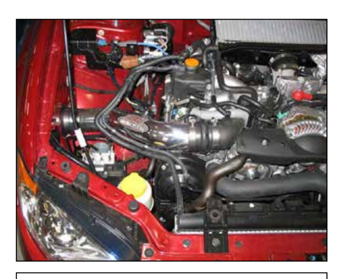
AEM® intake system installed