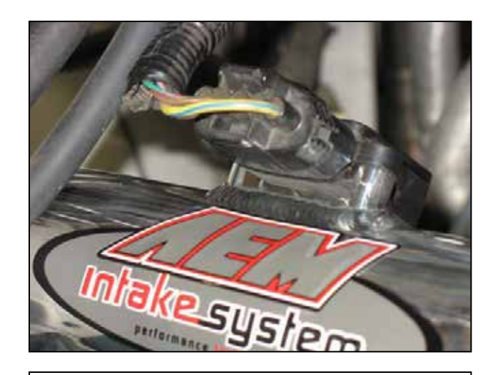
j. Plug the MAF sensor into the wiring harness.