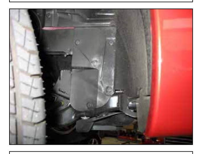
g. With the front wheels turned all the way to the right, locate the plastic clips just forward of the suspension holding the liner to the passenger side wheel well and remove them.