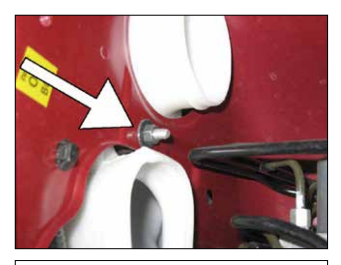
i. From the engine bay, remove the remaining nut securing the lower resonator.