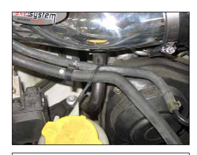
k. Secure the two rubber hoses to the rubber AC hose using the supplied 6" zip-tie. Trim excess plastic.