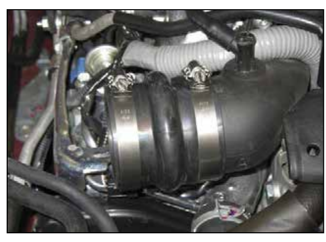
b. Install the hump hose coupler onto the stock turbo inlet tube and secure using a #44 hose clamp.

a. When installing the intake system, do not completely tighten the hose clamps or mounting hardware until instructed to do so.