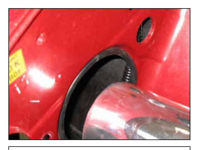
e. Install the rubber edge trim around the hole in the inner fender where the factory intake system was routed.