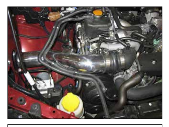
d. Install the upper intake pipe into the coupler on the turbo inlet. Rotate the pipe so that the filter end is centered in the hole in the inner fender. Secure the intake pipe using a #44 hose clamp.