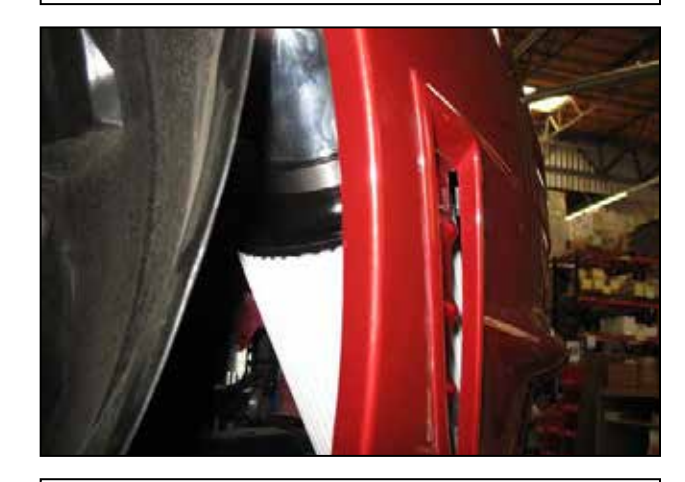
i. Install the air filter onto the end of the lower intake pipe. Push the air filter over the pipe until the stop in the air filter is reached. Use a #52 clamp to secure the air filter onto the intake pipe.