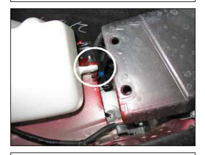
h. Move the wheel well liner to expose the lower resonator. Remove the lower nut securing the resonator to the chassis.

Remove the three plastic clips holding the wheel well liner to the underside of the vehicle's passenger side bumper.