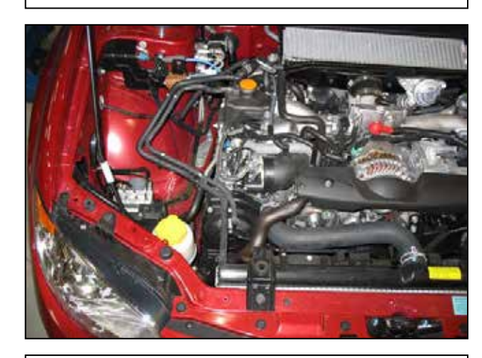
I. Stock air box system removed.