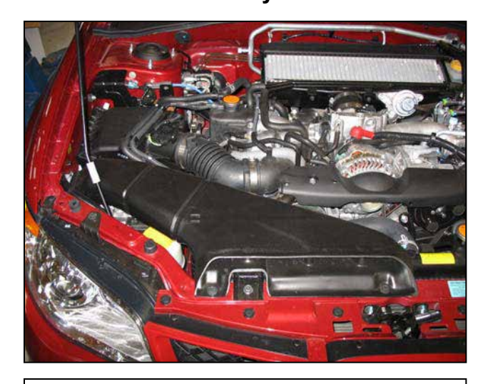
a. Stock air box system installed.