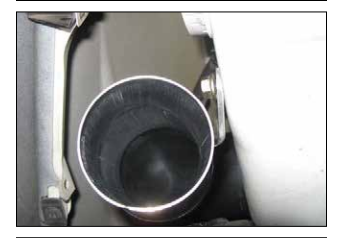
h. Install the previously removed factory M8 nut to secure the lower intake pipe. Align the lower pipe until the 90° coupler is centered in the inner fender hole and fully tighten the nut at this time.