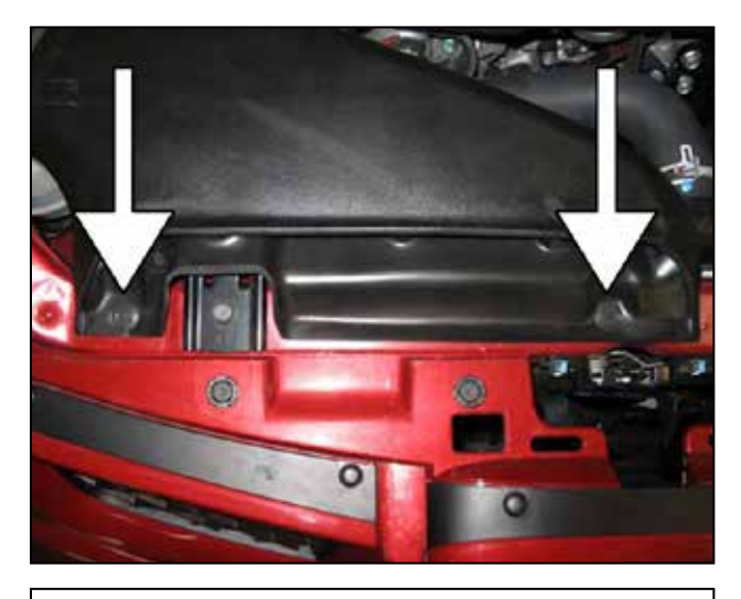
c. Remove the two mounting bolts securing the air inlet scoop and remove the scoop from the vehicle.