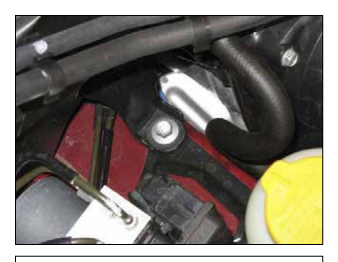
e. Down on the frame rail, on each side of the air box are the bolts that secure the air box in place. Remove the two bolts and gently lift out the air box assembly.