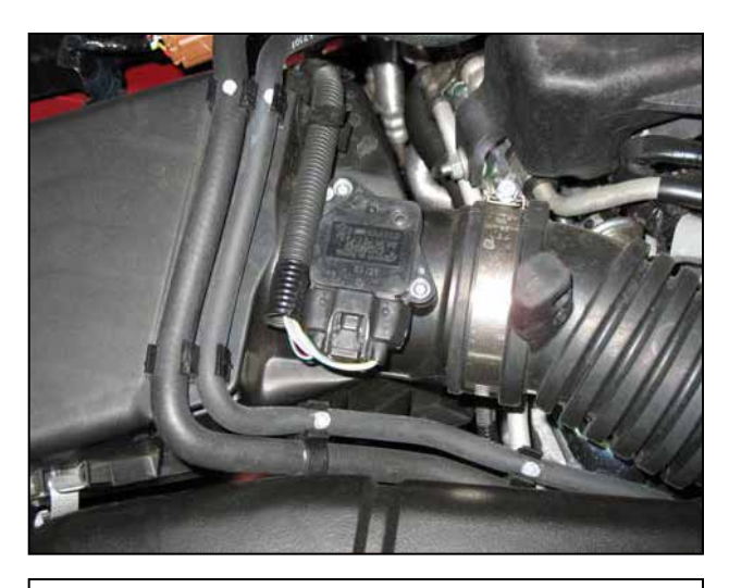
b. Unplug the mass air flow sensor (MAF) wiring harness.