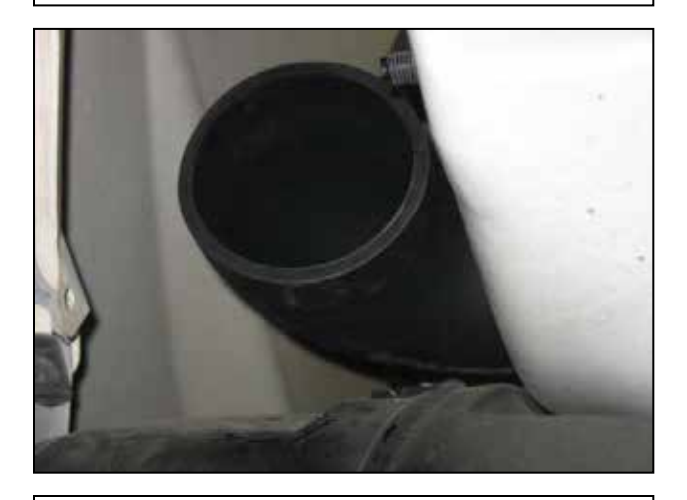
f. Install the 90° coupler by routing it through the inner fender hole and sliding it over the end of the upper intake pipe. Secure the coupler using a #44 hose clamp.