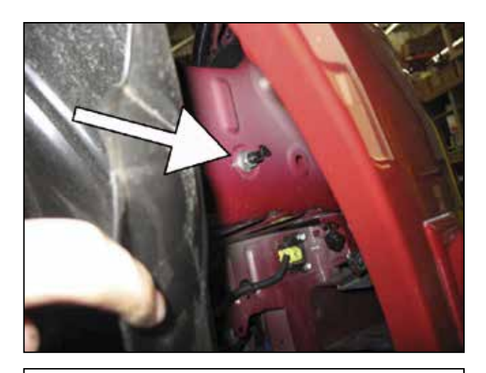
j. Locate the threaded stud behind the area where the lower resonator was mounted. Remove the nut on the stud and set it aside as it will be reinstalled later.