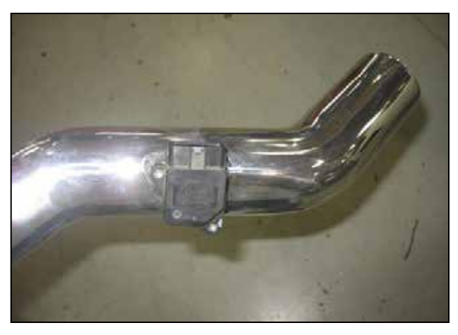
c. Using the two supplied 8-32 bolts, install the MAF sensor into the upper intake pipe.