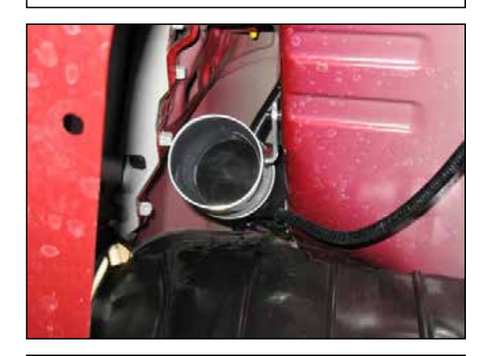
g. Install the lower intake pipe with the shorter side going into the 90° coupler. Rotate the pipe until the mounting bracket is aligned with the stud in the frame rail. Secure the intake pipe using a #48 hose clamp.