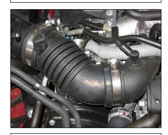
d. Loosen the two hose clamps on the stock air inlet tube and remove it.