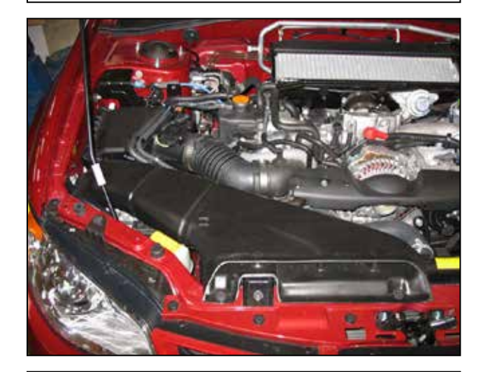
Stock air box system installed