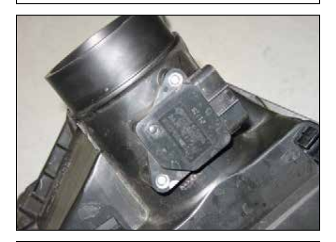
k. Remove the MAF sensor from the factory air filter housing.