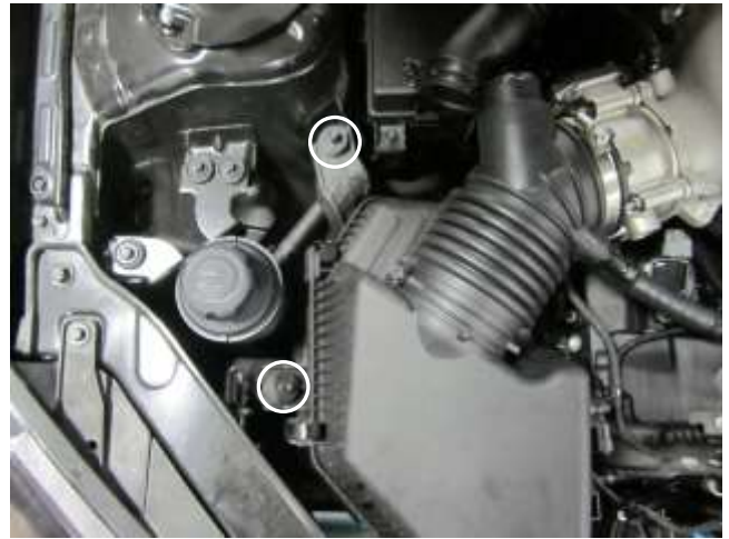
f. Remove the two bolts shown that secure the stock air box to the vehicle. Then remove the air box. NOTE: Do not discard any of your stock intake equipment.