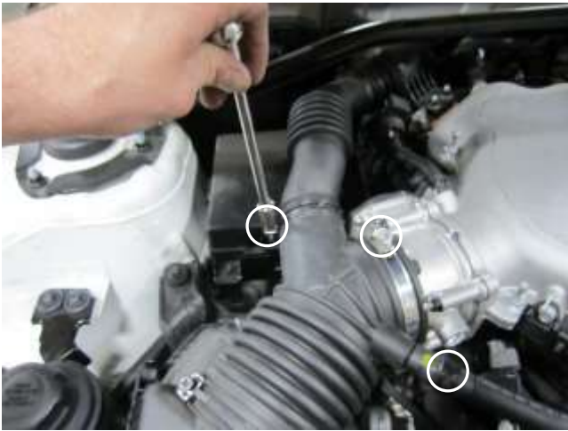
e. Loosen the hose clamps at the sound tube, the throttle body, and unclip the spring clamp on the vent line.