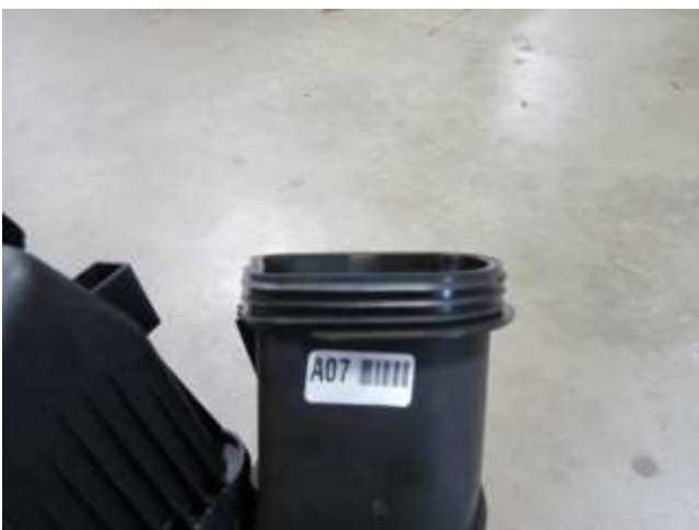
i. Remove the seal off of the stock air box. Note: This will be reused in step 3n.