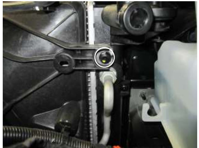
h. Remove the bolt on the front fan shroud. Note: These will be reused in step 3d.