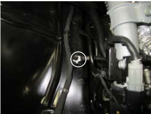
g. Remove the ground strap bolt located underneath the air box. This bolt will not be reused.