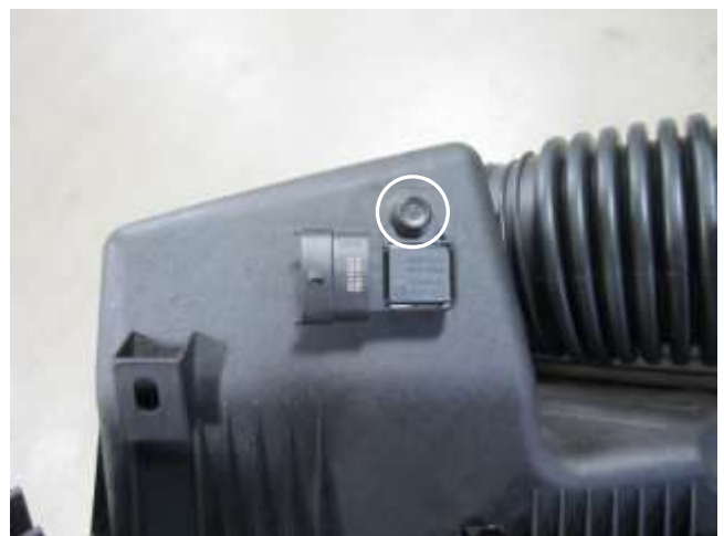
j. Loosen the bolt that secures the temperature sensor to the air box. Note: These will be reused in step 3a.