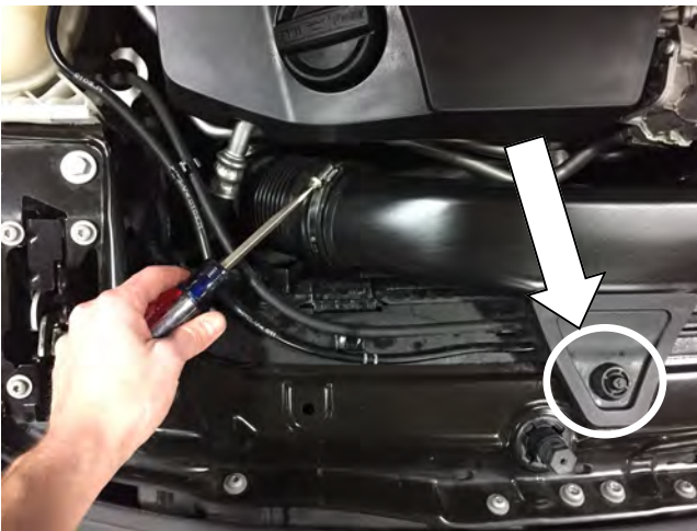
c. Loosen the clamp sealing the factory intake to the turbo inlet hose with a flat screwdriver or 6mm socket and disconnect the hose. Lift the tube mounting bracket off of its rubber mount. Set the rubber mount aside for reuse.