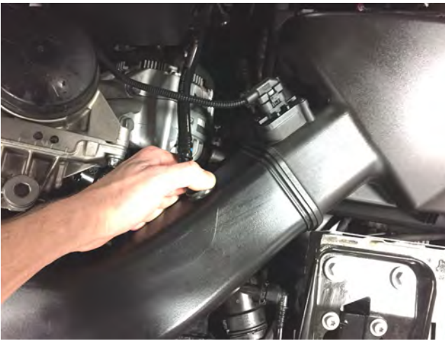
a. Squeeze the knurled portions of the quick release on the air line at the intake and pull to remove.