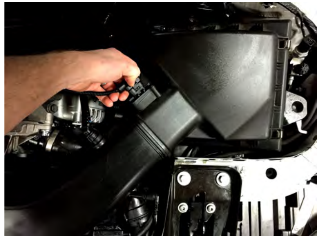
b. Disconnect MAF sensor wiring harness. Remove the sensor with a T20 Torx bit and set aside in a safe, clean place. Keep the screws for re-use.