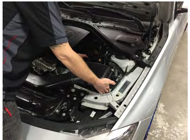
d. Gripping the airbox on both sides as shown, lift the factory intake plumbing out of its two mount sockets. The entire system can now be removed.