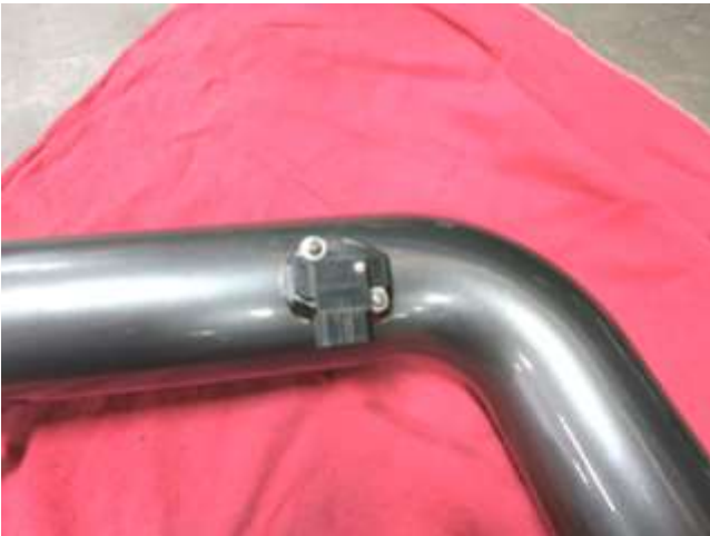
c. Install the MAF sensor with factory screws removed in step 2m onto the AEM intake tube.