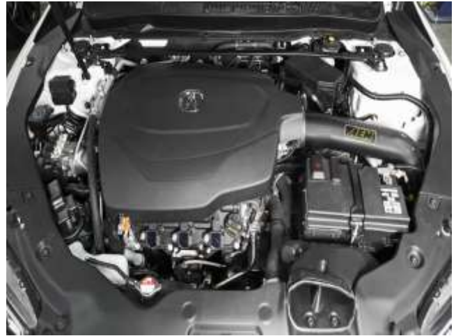
AEM INTAKE SYSTEM