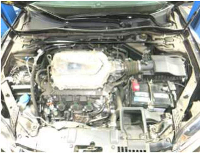
a. Remove the engine cover by lifting straight up.