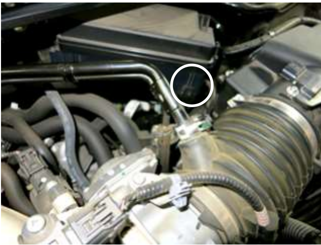
c. Squeeze the spring clamp and remove the vent line from the stock intake duct. This will be reused in step 3f.