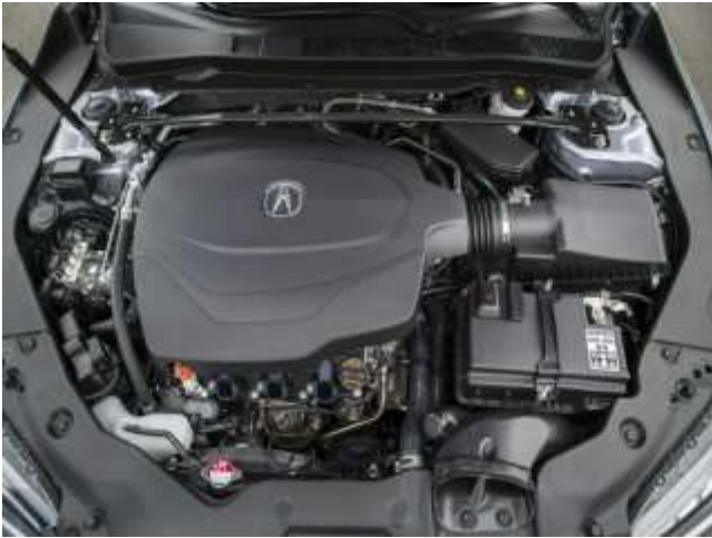
STOCK INTAKE SYSTEM