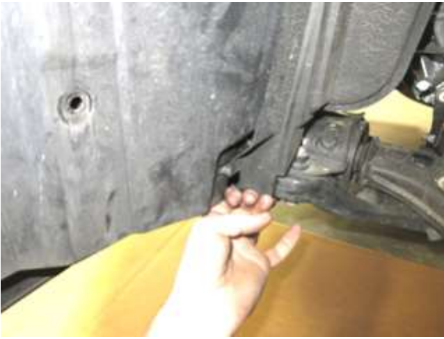
j. Separate the undercarriage panel from the fender liner by rotating them away from each other.