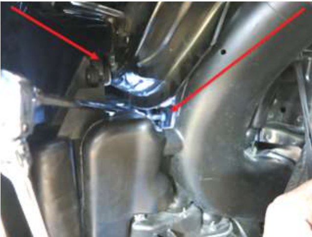
l. First remove the bolt shown above on the left, allowing you to lower the resonator. Using a short 10mm socket and u-joint on the end of at least 14" of extension