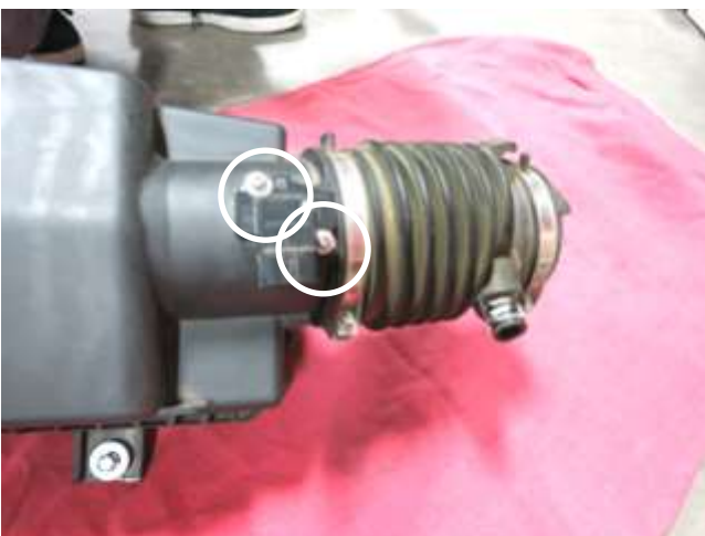
m. Remove the two screws securing the MAF to the stock air box. These will be reused in step 3c.