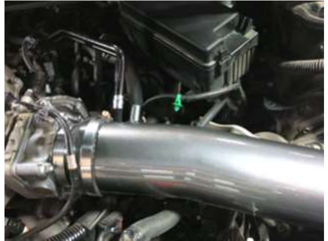
d. Install the AEM intake tube into the coupler that was previously installed. Do not tighten the hose clamp at this time.