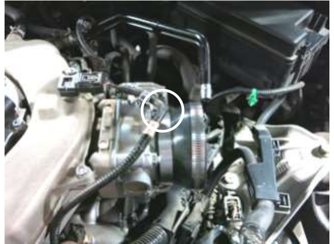
b. Install the included coupler and hose clamps as shown on the throttle body. Tighten the one closest to the throttle body to 30 in-lbs.