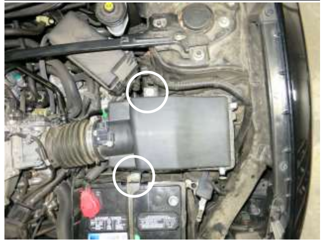
d. Remove the two bolts circled that secure the air box to the vehicle.