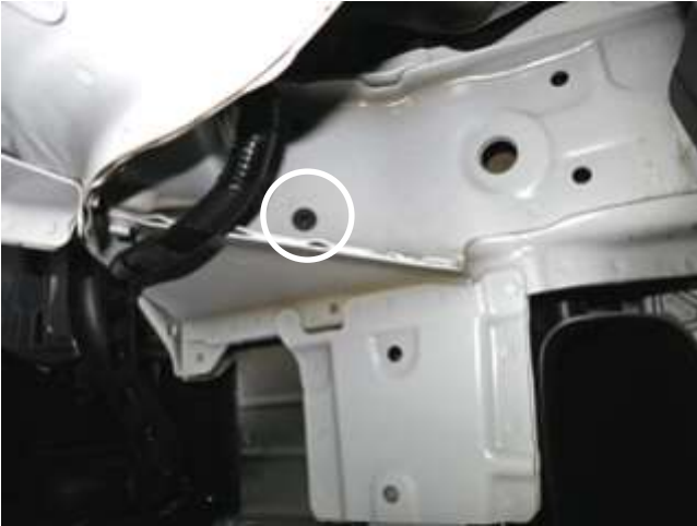
a. Install the provided wellnut into the frame of the vehicle as shown. Note: Use soap and water to ease installation.