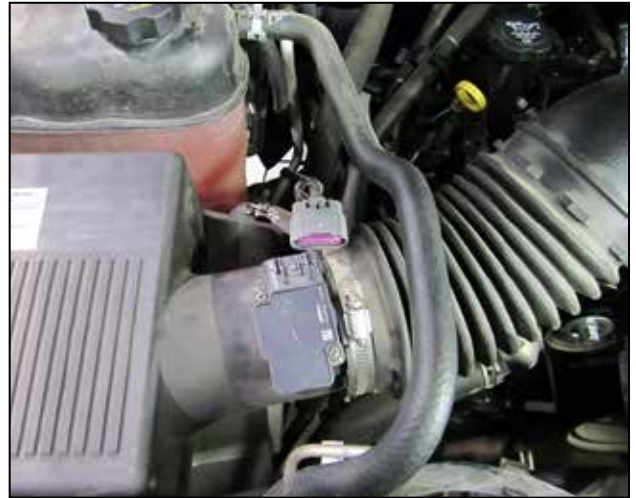
b. Unplug the MAF sensor connector from the MAF sensor.