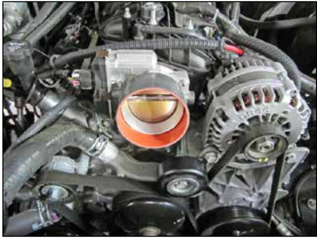
k. Install the coupler onto the throttle body.