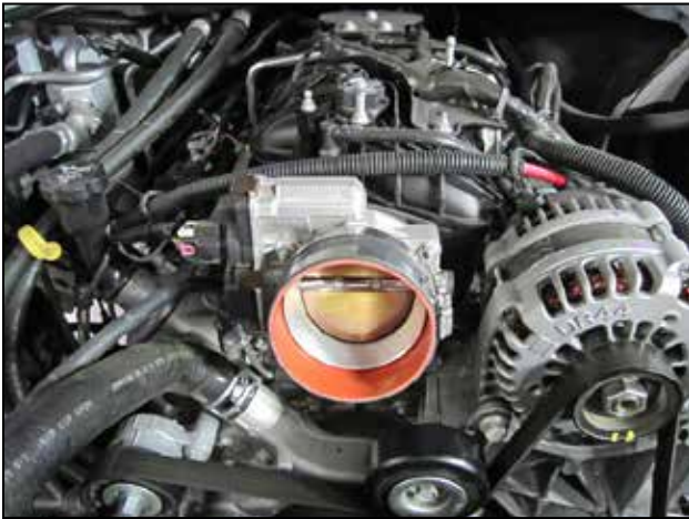
l. Install two hose clamps onto the coupler.