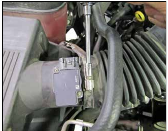
d. Loosen the hose clamp that secures the inlet tube to the air filter box.