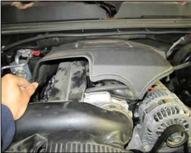
a. Remove the engine cover; lift up to release the tabs from the grommets that secure it in place.