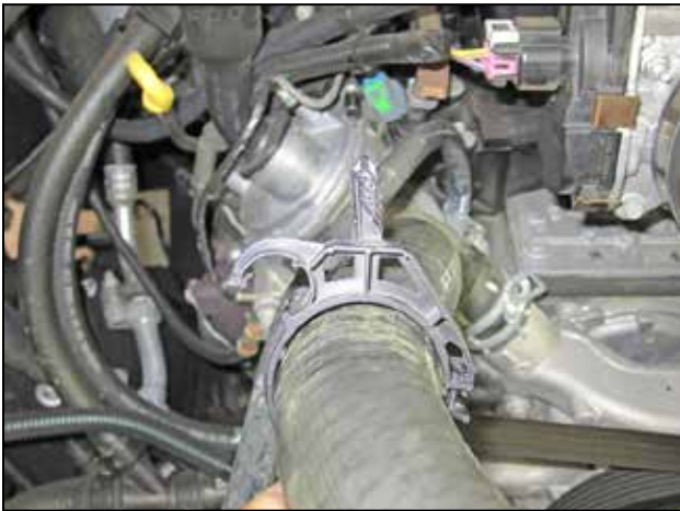
n. Remove the plastic clip attached to the upper radiator hose.