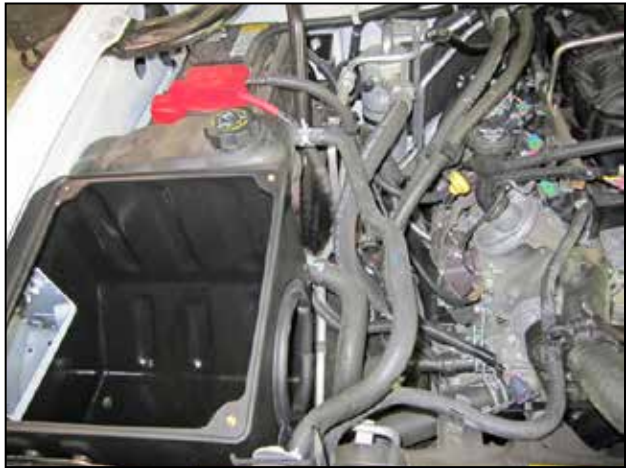
m. Replace the overflow tank in its original location and fasten it with the factory nut and bolt that were removed in step 2k.