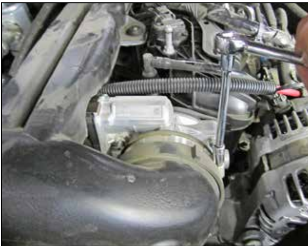
c. Loosen the hose clamp on the throttle body end of the inlet tube.