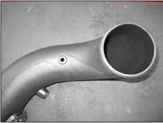
j. Install the grommet in the intake tube.