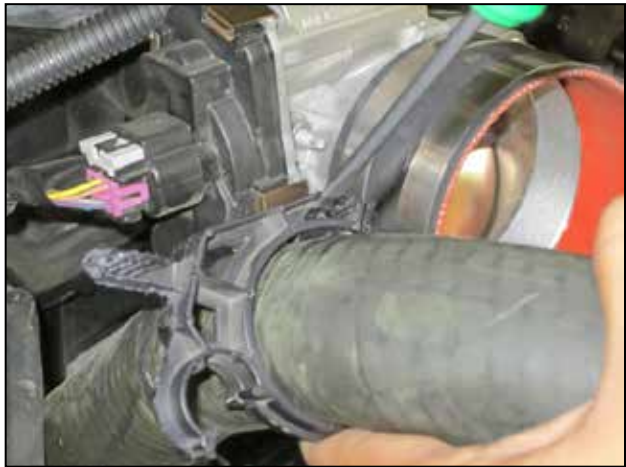
o. Flip the plastic clip around and position it on the upper radiator hose as shown.