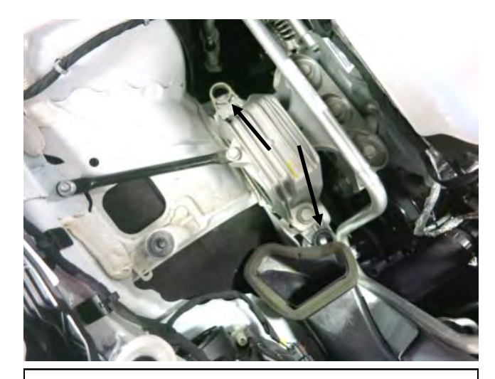
e. Lift the air box and intake hose up and out of the engine bay. Remove the rear grommet and keep the front grommet installed as shown.