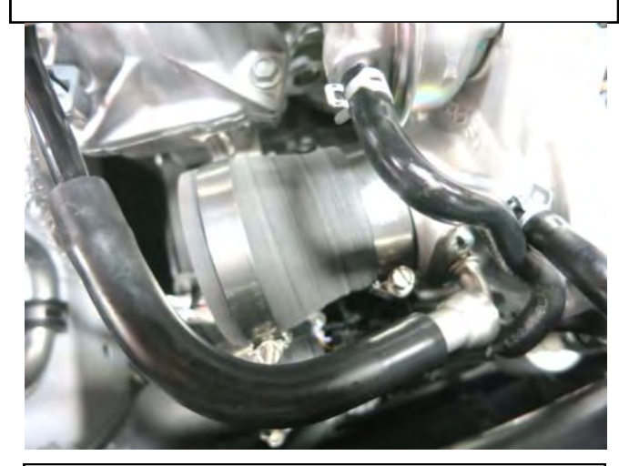
e. Install the provided coupler with the small end at the turbo. Use the provided hose clamps. Open the hose clamps all the way prior to installation. Tighten the turbo side clamp at this time to 30 in-lb.