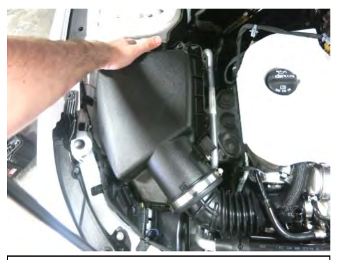
d. Release the air box from its rubber grommets by pulling up gently on the air box as shown.