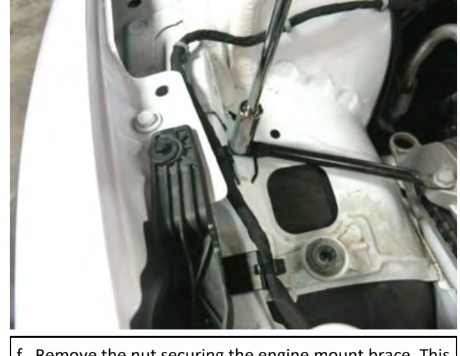
f. Remove the nut securing the engine mount brace. This nut will be reused in step 3i.