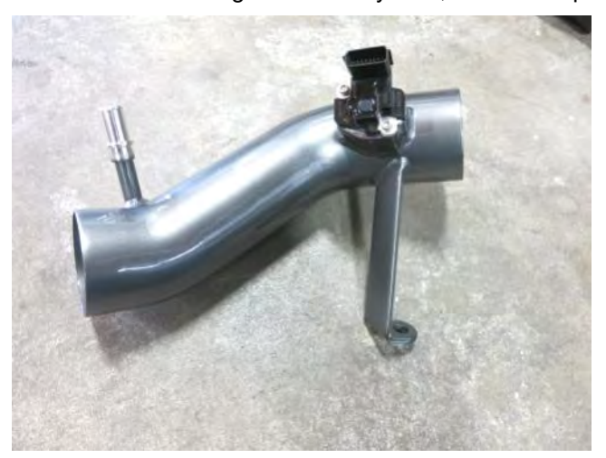
a. Install the MAF sensor into your AEM intake tube using the provided screws.

a. When installing the intake system, do not completely tighten the hose clamps or mounting hardware until