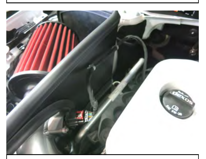
I. Connect the MAF connector to the MAF sensor and secure the harness with the factory ties into the holes on the heatshield. The ties may need to be repositioned for best fit.