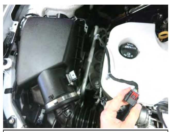
a. Disconnect the Mass Air Flow (MAF) sensor connector and harness ties from the sensor and air box.