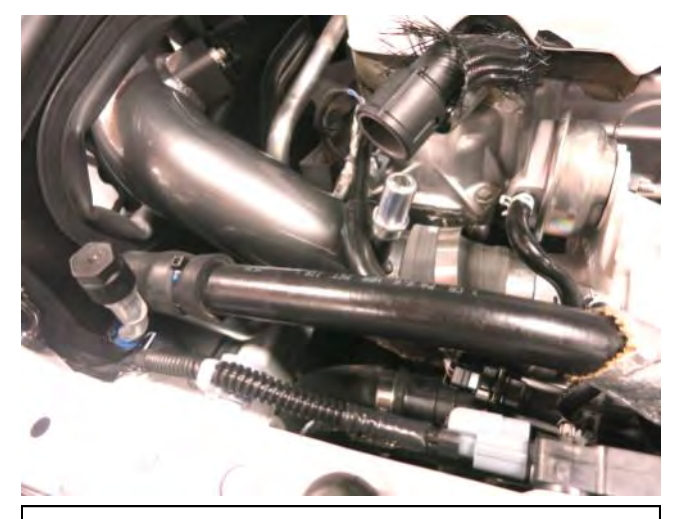
g. Maneuver the fitting on the intake tube past the vacuum line as show. Ensure the intake tube is fully seated into the big end of the coupler. Soapy water can help with installation.