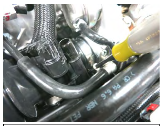
c. Loosen the hose clamp at the turbo side of the factory air hose.