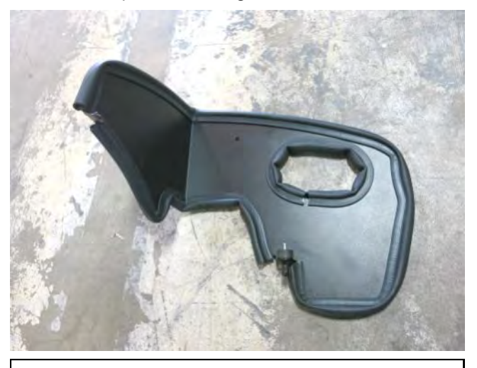
b. Assemble the heat shield with the edge trim, rubber mount, and nylon air box mount. Use a 12mm wrench to tighten the air box mount.