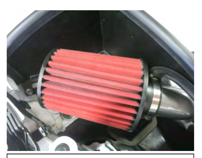
j. Install the AEM Dryflow filter using the provided hose clamp. Tighten the clamp to 30 in-lb.