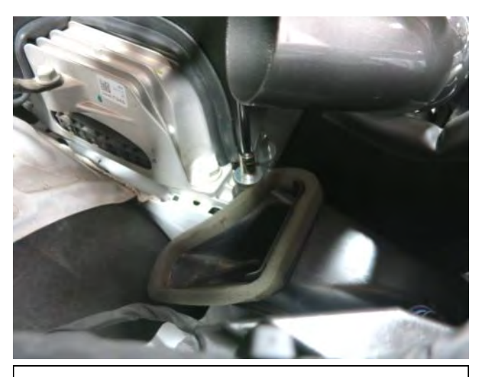
h. Fully tighten the intake tube bracket to the rubber mount at this time.