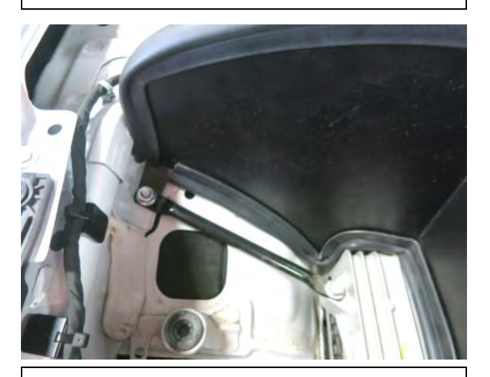
i. Using the nut removed in step 2f, secure the heat-shield to the inner fender.