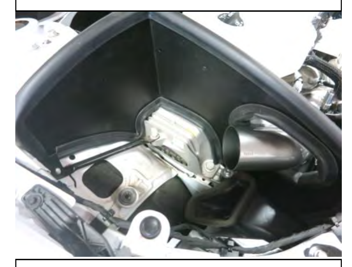
f. Install the assembly into the car as shown . Push the heatshield mount into the grommet and align the tab with the engine brace stud. Guide the intake tube into the coupler as shown in step 3g.