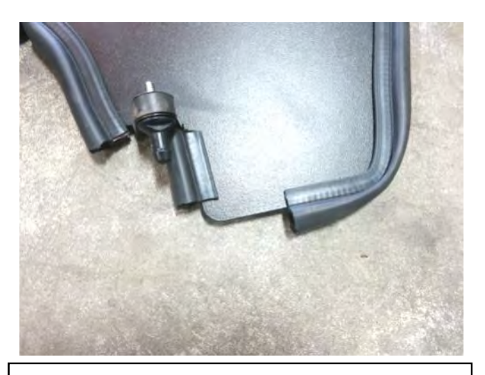
c. The edge trim may need to be trimmed as shown to clear the AC line bracket. You may temporarily install the heatshield and close the hood to check for clearance issues.