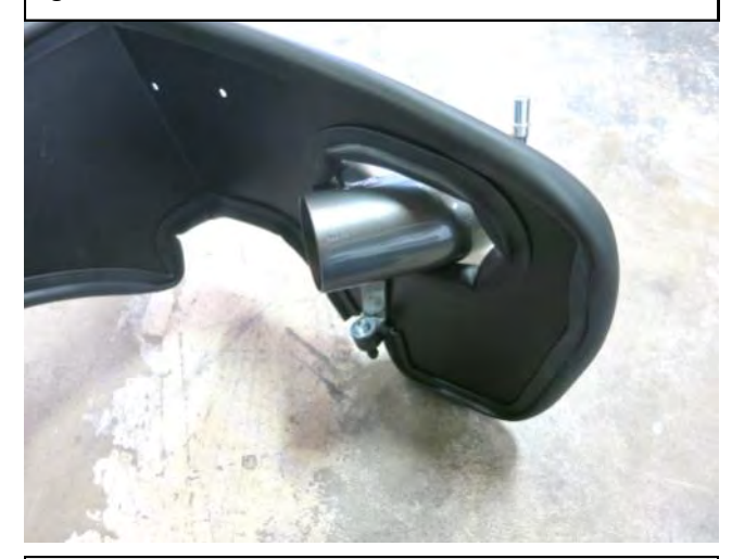
d. Install the AEM intake tube into the heatshield and loosely secure with the provided nut and washer as shown.