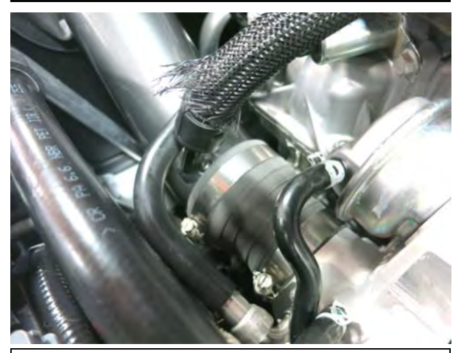
k. Connect the PCV line to the fitting on the intake tube. Ensure it clicks into place and is securely attached.