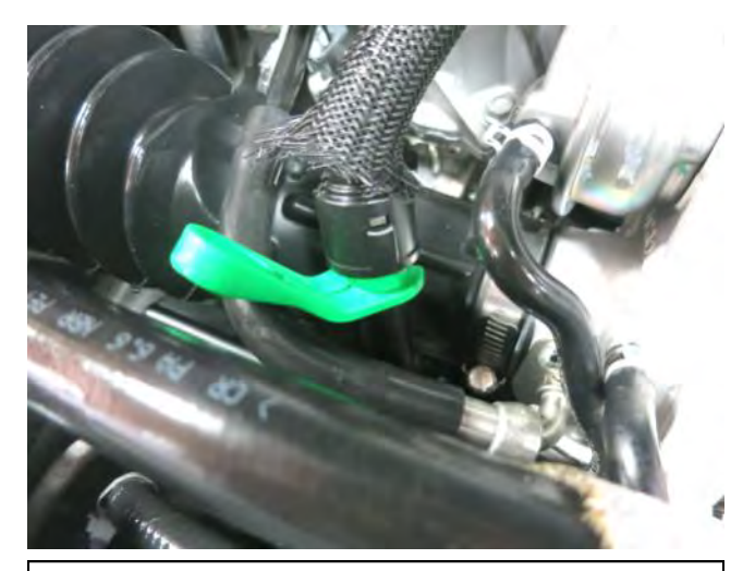
b. Use a 5/8" AC/fuel line disconnect tool to release the PCV connection. Pull the PCV line free and away from the fitting.