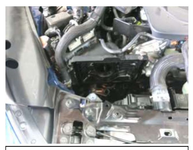
c. Unlatch the forward half of the factory air box and remove it. Also remove the air filter. Do not discard any factory components/hardware.