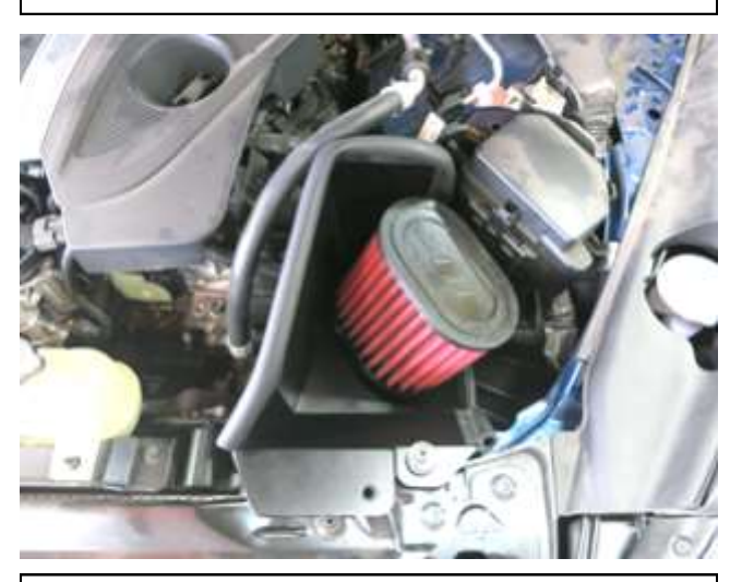
h. Repeat previous step for passenger side. Then reinstall the factory radiator shroud/cold air duct.