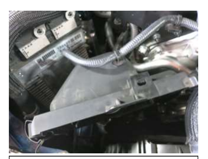
d. Unclip the mass air flow (MAF) harness from the rearward half of the factory air box. Then, disconnect the harness from the sensor itself.