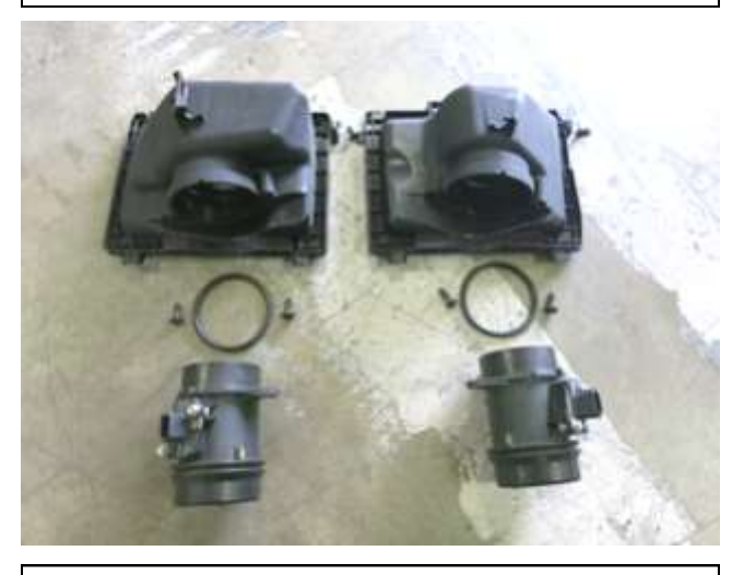
g. Remove the 2 screws that hold the MAF housing to the air box. Then separate the MAF housing from the air box. Set the o-rings aside, they will not be reused.