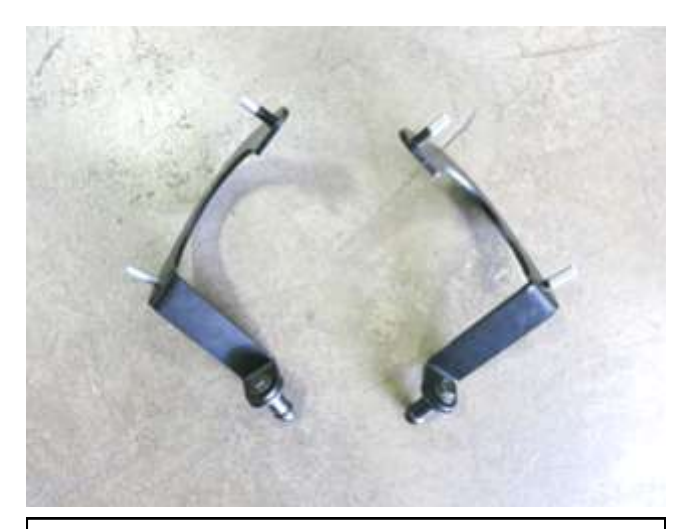
b. Assemble both MAF housing brackets as shown.