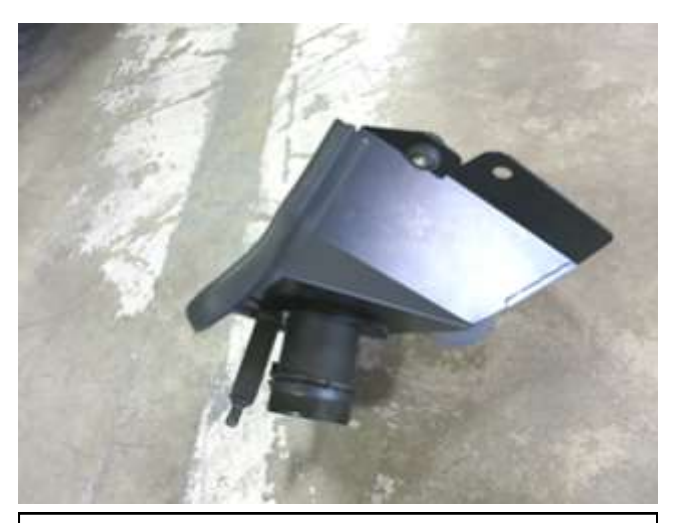
d. Assemble the passenger side intake system as shown. Take care to use the correct MAF housing bracket (part number "7-362" will be stamped on).