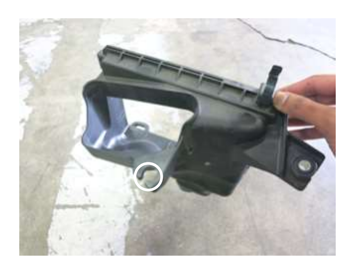
h. Remove the grommet and sleeve from the forward half of the factory air box. Do this for both air boxes. You will reuse these components in step 3a.