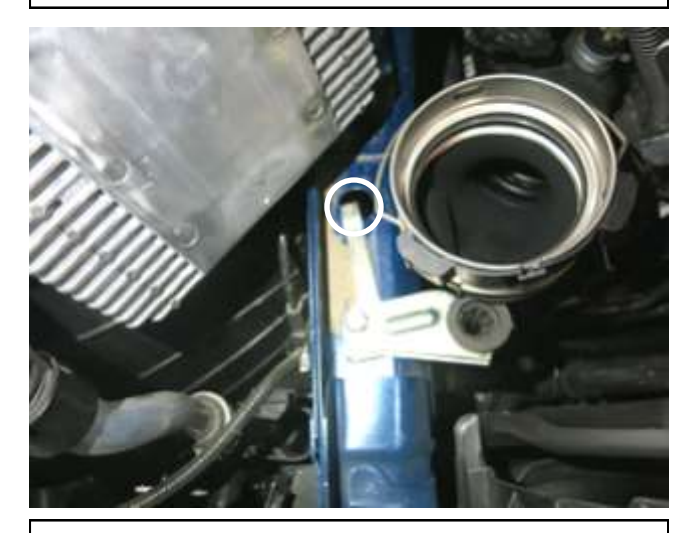
i. Remove the bracket shown and replace the grommet into the hole in the frame rail (circled above).