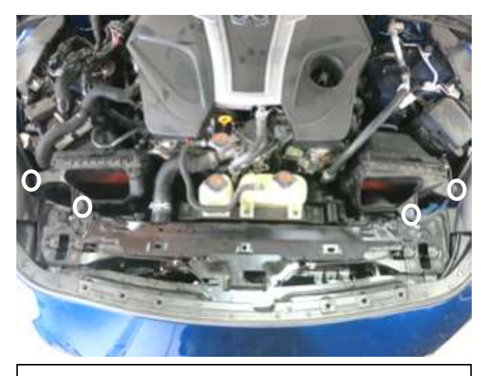
b. Remove the 4 bolts securing the factory air boxes.