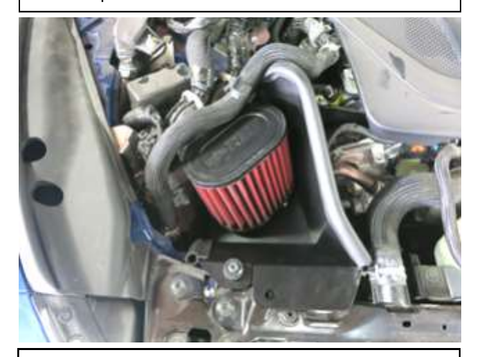
g. Place the driver side intake system into the engine bay. Reconnect the MAF harness to the sensor. Insert the MAF housing into the turbo inlet hose. Make sure the retaining clip snaps back into engagement. Then push down on the heatshield until you feel the plastic stud seat into the grommet in the frame rail. Secure to upper core support with one of the factory bolts removed in step 2b.