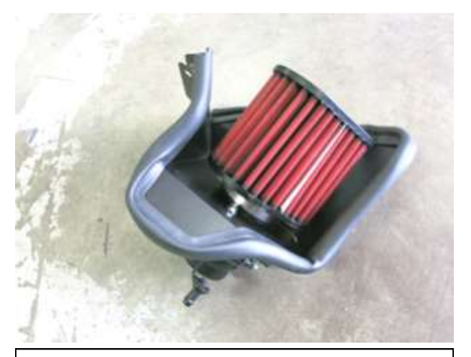
e. Install the air filter with the supplied hose clamp to the driver side intake system as shown. Then tighten the hose clamp to 30 in-lbs.