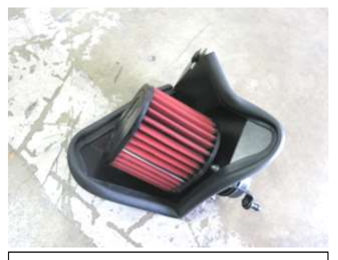
f. Install the air filter with the supplied hose clamp to the passenger side intake system as shown. Then tighten the hose clamp to 30 in-lbs.