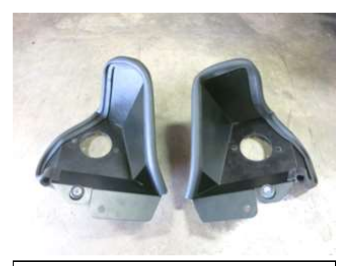
a. Apply edge trim to both heat shields as shown. Cut the single 80" length of trim as necessary. Also install the grommets and sleeves removed in step 2h.

a. When installing the intake system, do not completely tighten the hose clamps or mounting hardware until instructed to do so.