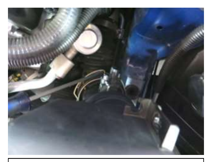
e. Use a long flat head screwdriver to disengage the retaining clip as shown. This will allow you to separate the MAF housing and air box from the turbo inlet hose. NOTE: The retaining clip must be FULLY disengaged from the MAF housing to allow for separation. Minimal force is required to do this. Do not forcefully pull or pry on the MAF housing or clip, or damage may occur.