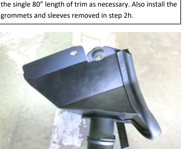
c. Assemble the driver side intake system as shown. Take care to use the correct MAF housing bracket (part number "7-363" will be stamped on).