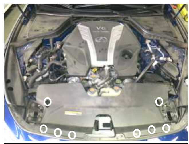
a. Use a small flat head screwdriver to remove the 8 push-in clips shown. Then, pull off the factory radiator shroud/cold air duct.