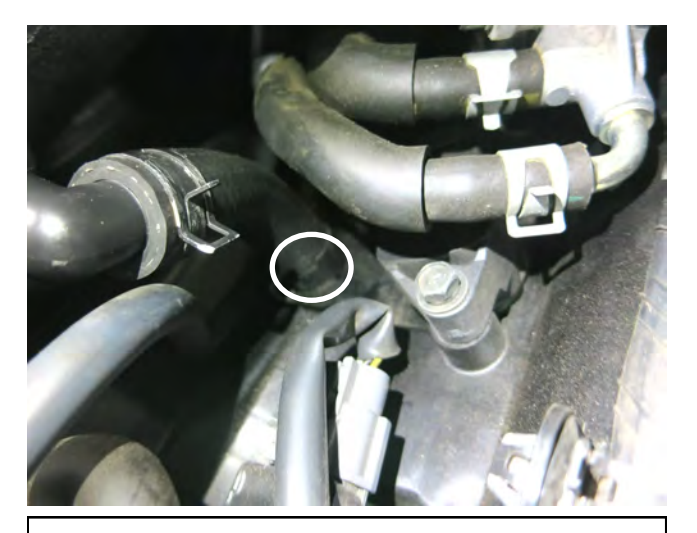
k. Repeat for driver side.