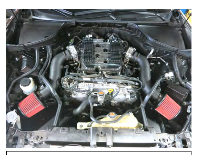
I. Install the AEM filters. Orient them for best fit. Then tighten the hose clamps on the throttle body couplers to fully secure the intake tubes.