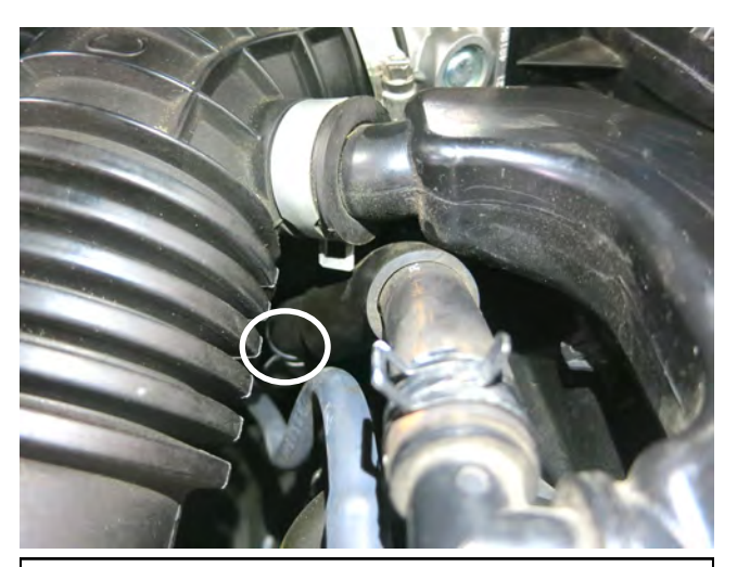
g. Use pliers to release the spring clamp shown above (passenger side pictured).