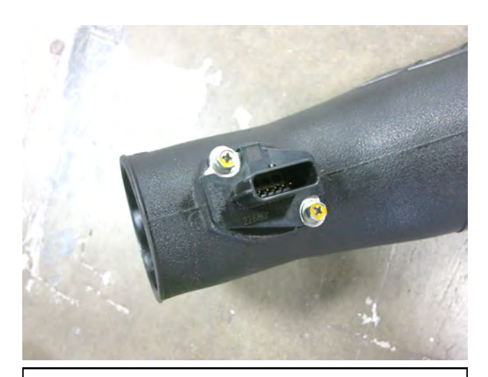
a. Install the MAF sensors into both AEM intake tubes.

a. When installing the intake system, do not completely tighten the hose clamps or mounting hardware until instructed to do so.