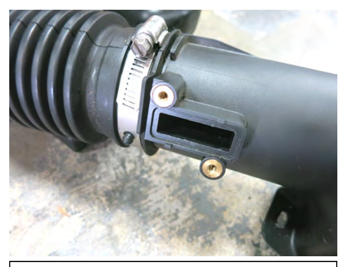
i. Remove the MAF sensor from the intake tube. Repeat for other intake tube.