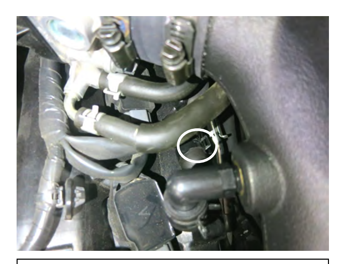
j. Reposition the spring clamp onto the breather hose (driver side pictured).