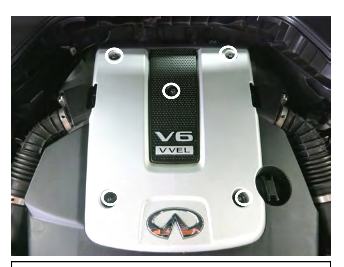
b. Use a 10mm socket and ratchet to remove the [2] nuts and [3] bolts holding the engine cover. Remove the