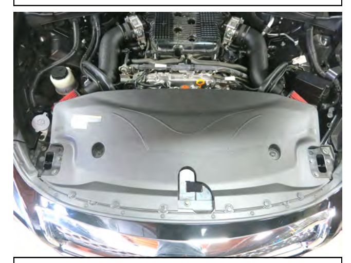
n. Reinstall the radiator shroud and engine cover.