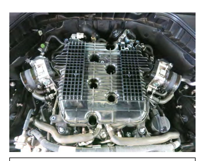
c. Install the [2] couplers along with [4] hose clamps onto the throttle bodies as shown. Tighten the hose clamps on the throttle body side at this time.