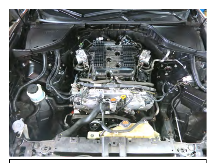
h. Loosen both throttle body hose clamps and the pull both intake tubes and air boxes from the engine bay. Make sure the [4] grommets are still seated in the frame rails.