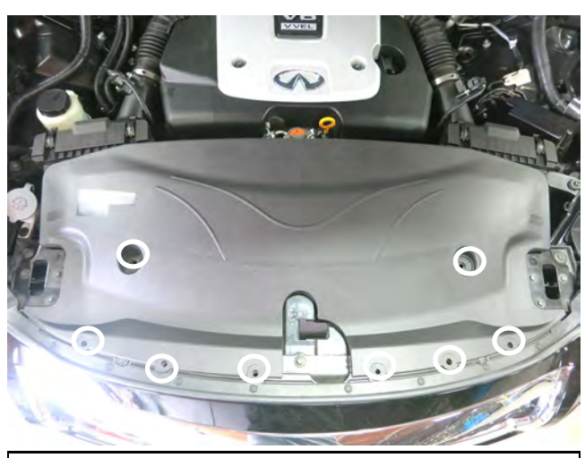
a. Use a small flat head screwdriver to remove the [8] clips holding the radiator shroud. Remove the shroud.