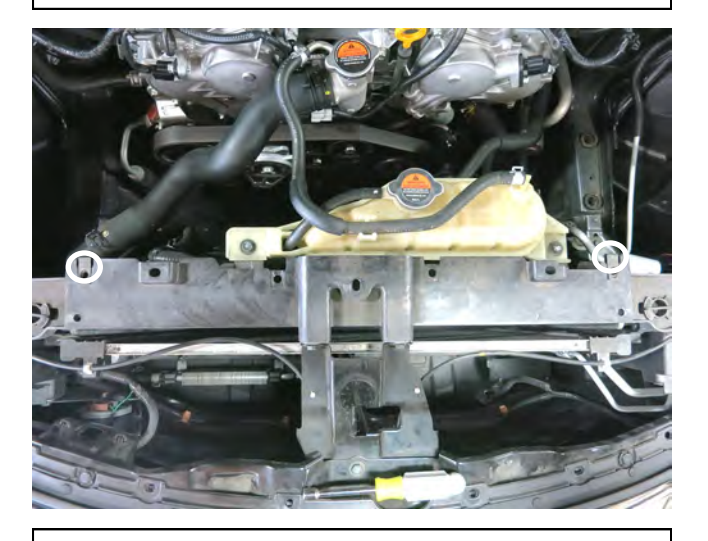
d. Install the [2] clip nuts onto the upper core support in the locations shown above.