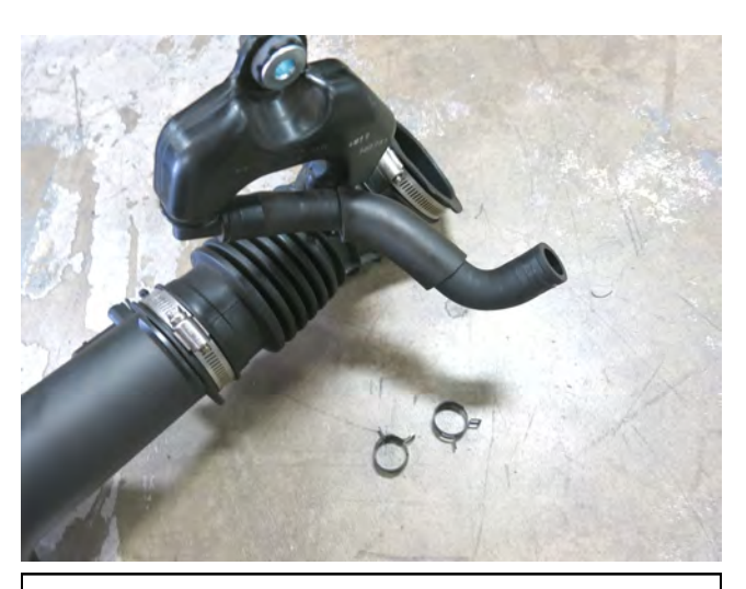
k. Remove the [2] spring clamps from the breather hose (passenger side pictured). Do not discard any factory components or hardware removed thus far.