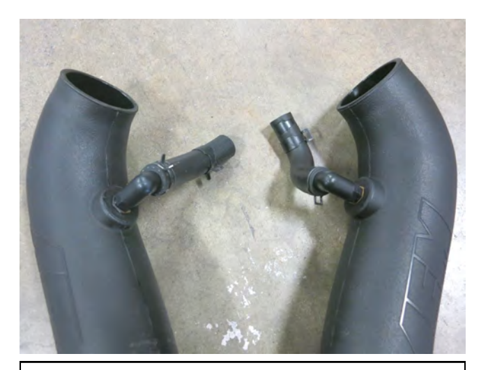
b. Install the plastic 90° fittings into the intake tubes as shown. Do not overtighten. Thread sealant is not required. Install the supplied 5/8" x 5" hose with the [2] factory spring clamps onto one tube. Install the factory breather hose (removed in step 2j) onto the other tube. Orient the hoses as shown.