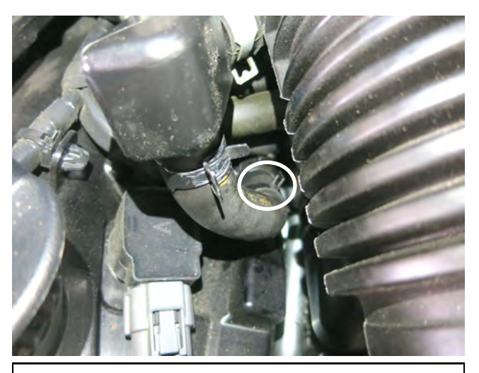
f. Use pliers to release the spring clamp shown above (driver side pictured).