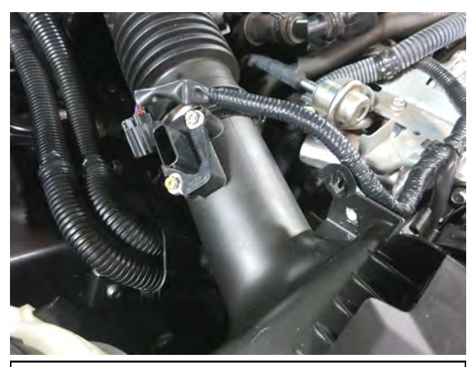
c. Unplug the Mass Air Flow (MAF) sensor harness and unclip it from the air box. Repeat for other side.