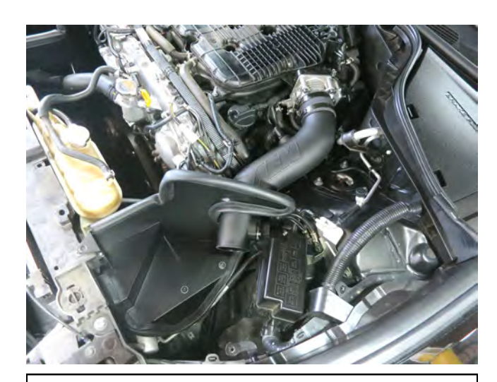
h. Repeat for driver side.