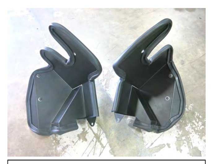
e. Apply the supplied edge trims to the heat shields as shown above. Trim if needed.