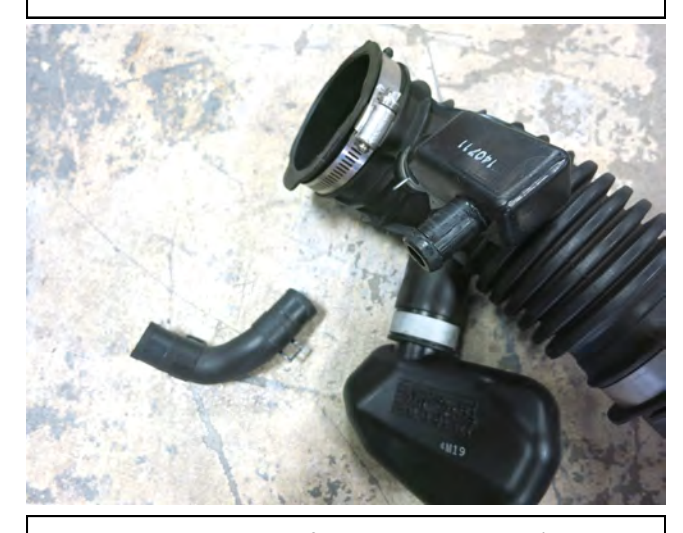
j. Pull the breather hose from the intake tube (driver side pictured).