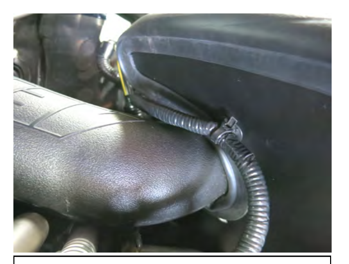
m. Route the MAF harness above the intake tube and clip it into the provision on the heat shield. Repeat for other side.