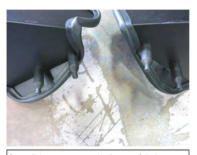
f. Install the post mounts to the bottom of the heat shields.