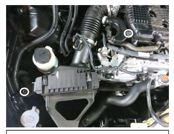
e. Remove the [2] M6 bolts in the locations shown above.