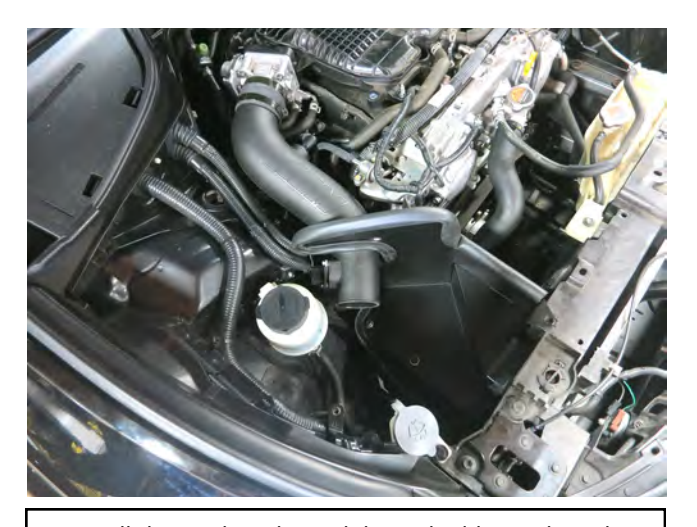
g. Install the intake tube with heat shield into the vehicle. Insert the intake tube into the coupler. Install the breather hose onto its respective port. Then fully seat the post mounts on the heat shield into the grommets on the frame rails.