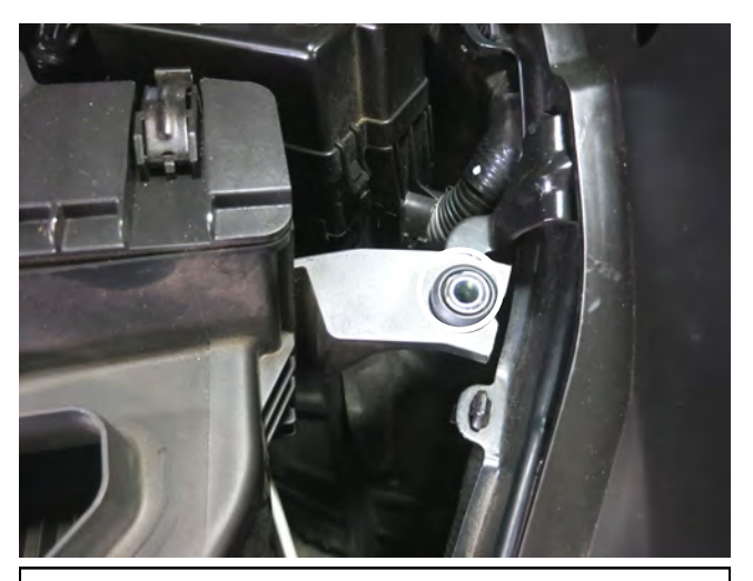
d. Remove the M6 bolt in the location shown above.