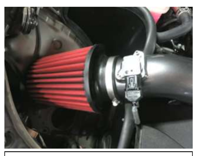
I. Install the AEM filter and tighten the hose clamp on the filter.