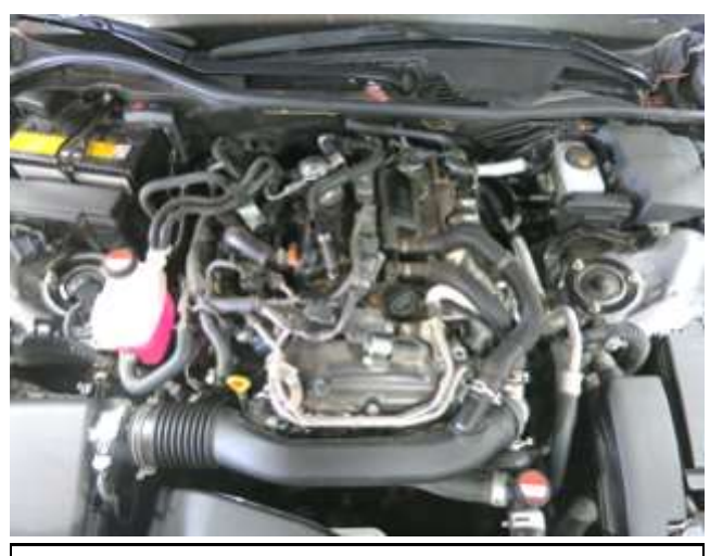
a. Carefully pull up on engine cover and remove it.