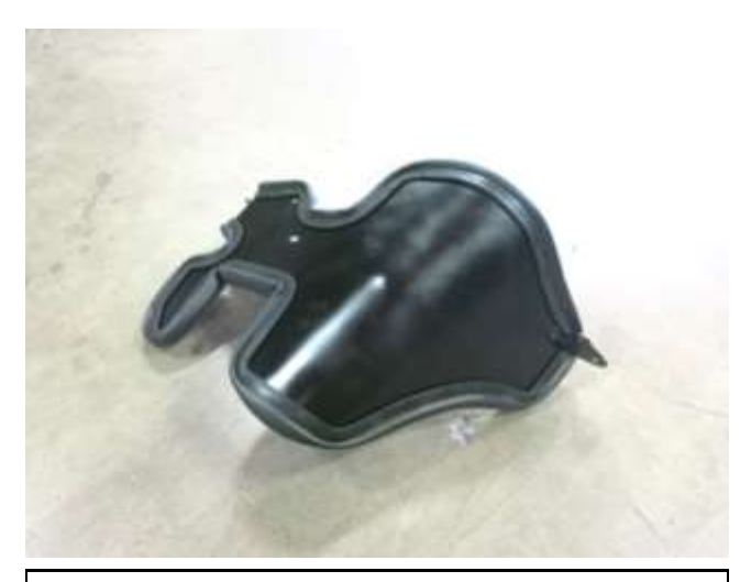
a. Apply the supplied bulb seal trim to the heat shield as shown. Trim as necessary.

a. When installing the intake system, do not completely tighten the hose clamps or mounting hardware until instructed to do so.