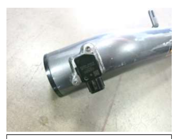
c. Install the MAF sensor using the supplied M4 bolts.