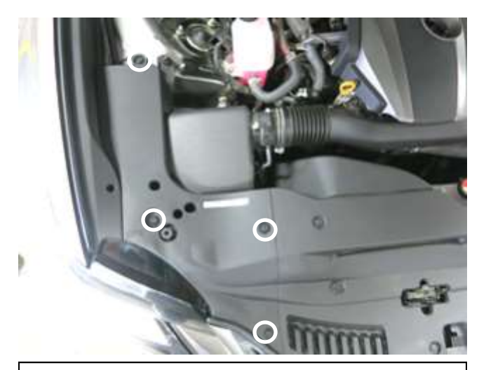
b. Remove the [4] retention clips by depressing the mandrel in the center. Then pull off the plastic shroud.