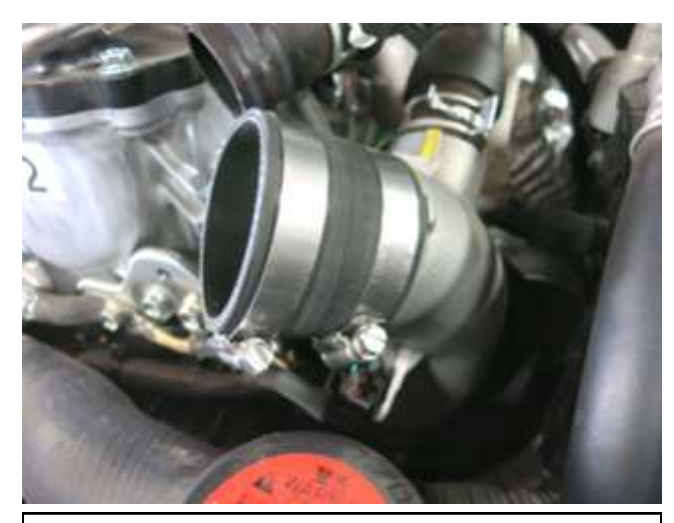
d. Install the coupler with hose clamps onto the turbo inlet pipe. Make sure the smaller end of the coupler is fitted to the turbo inlet side. Tighten the hose clamp on the turbo inlet side at this time.