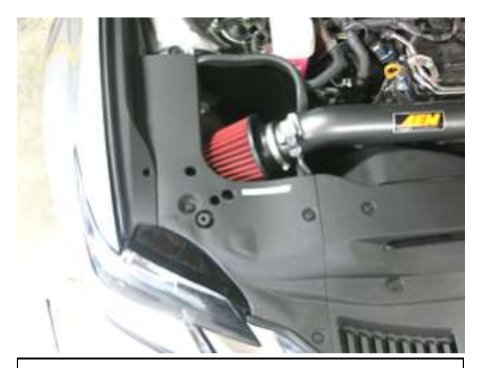
m. Reinstall the plastic shroud with the [4] retention clips. To reinstall the retention clips: Pull the mandrel from the main clip, insert the clip into its respective location, and reinsert the mandrel.