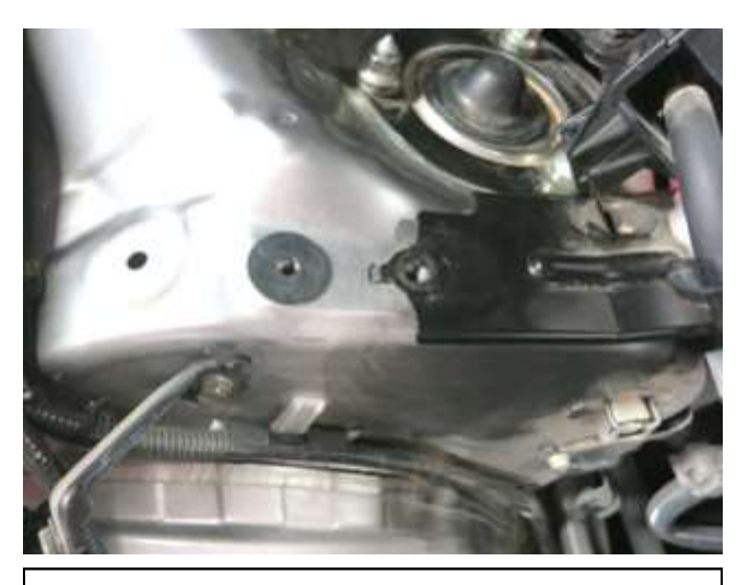
f. Place the rubber washer as shown.