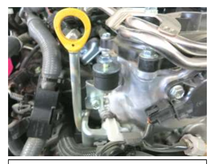
e. Install the rubber mount, washer, and nut onto the bracket as shown. Leave the nut loose.