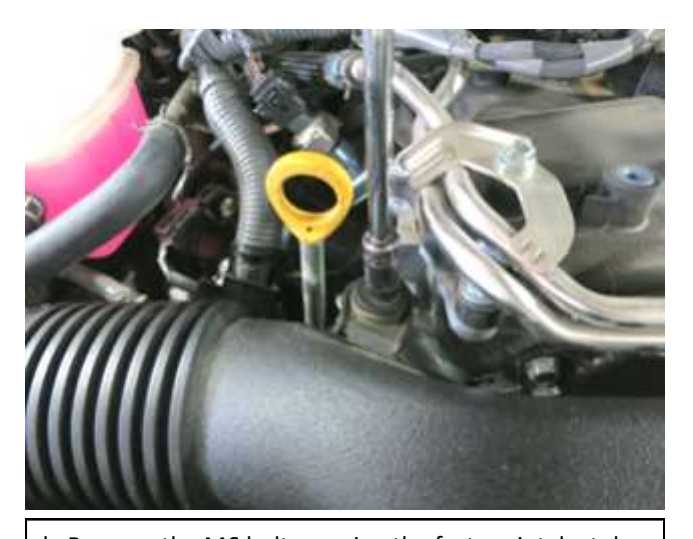
d. Remove the M6 bolt securing the factory intake tube.