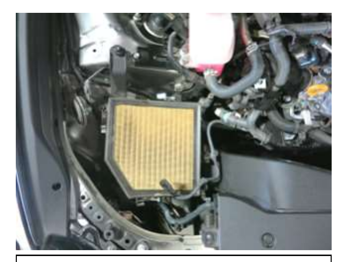
f. Undo the [4] airbox latches and remove the upper intake assembly.