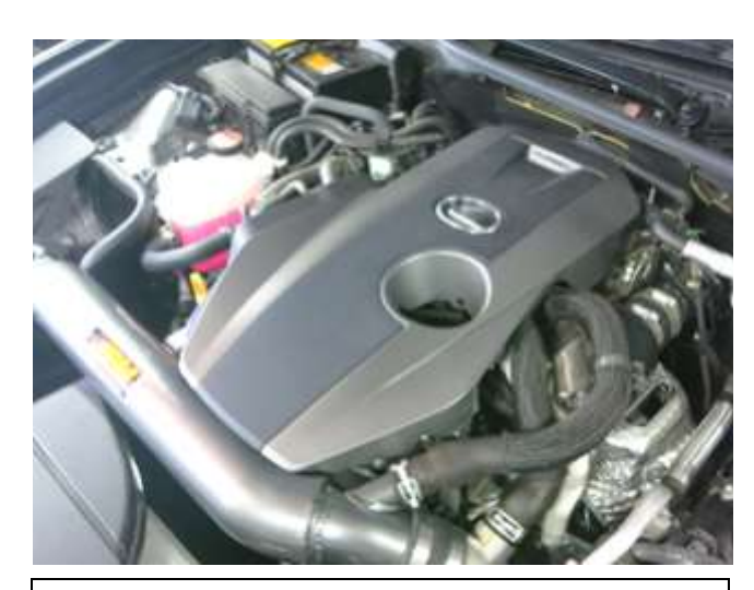
n. Reinstall the engine cover. Make sure the grommets are fully seated.