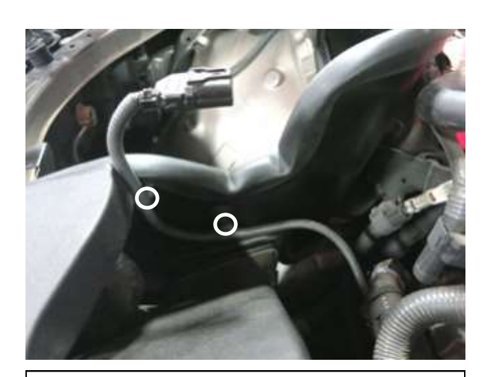
h. Clip the MAF harness to the heatshield in the locations shown.