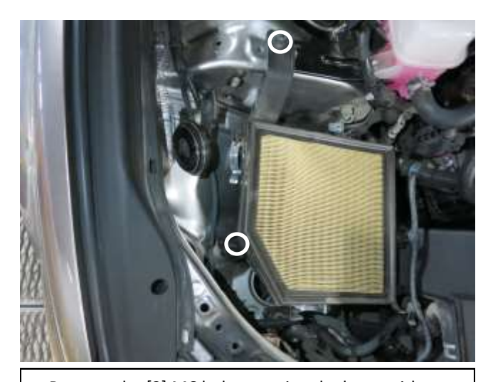
g. Remove the [2] M6 bolts securing the lower airbox.