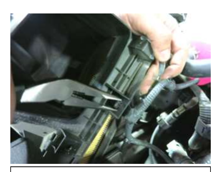
h. Flip the lower airbox around and unclip the MAF harness.