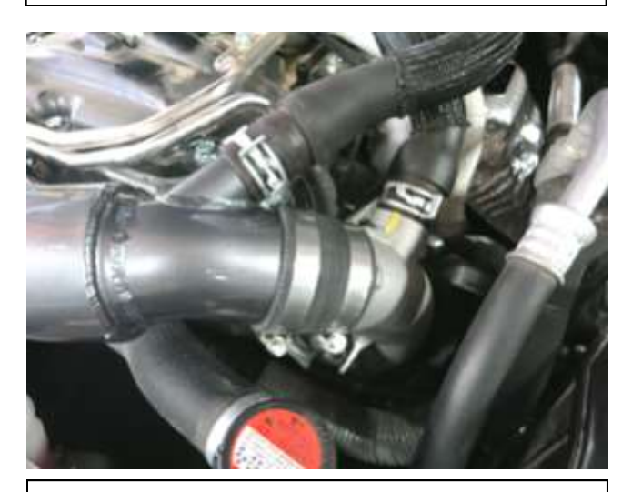
i. Insert the AEM intake tube into the turbo inlet coupler. Leave the hose clamp loose. Connect the PCV hose to the port on the intake tube.