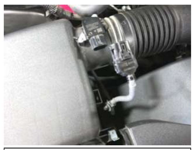
c. Unplug the Mass Air Flow (MAF) sensor harness and unclip it from the upper air box.