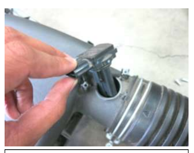
k. Remove the MAF sensor from the factory intake tube. Do no discard any factory components or hardware removed thus far.