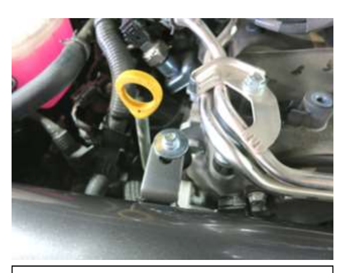
j. Align the mounting bracket to the rubber mount. Position the tube for best fit, then tighten the nut. Also, tighten, the hose clamp left loose in previous step.