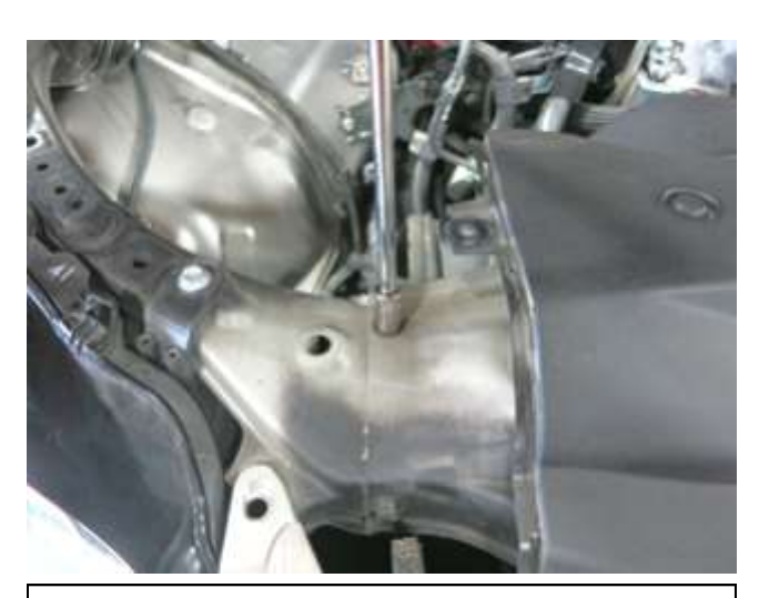
i. Remove the M6 bolt on the core support.