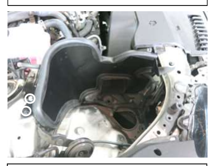
g. Place the heat shield into the engine bay. Make sure the cold air scoop is properly aligned in the heat shield cut-out. Then secure with the supplied M6 bolt and the [2] M6 bolts removed in steps 2i & 2j.