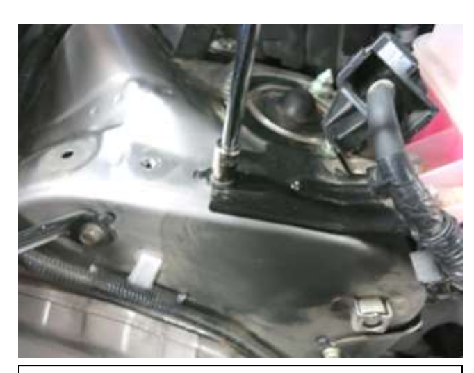
j. Remove the M6 bolt securing the ground cable bracket.