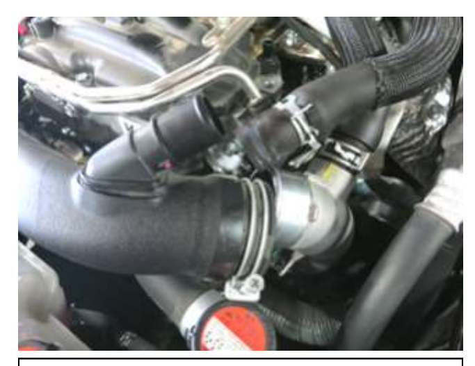
e. Loosen the intake tube hose clamp and pull the PCV hose from the intake tube.