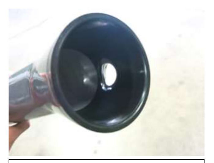
b. Insert the venturi into the intake tube. Be sure to align the pass-thru cutout in the venturi with the hole for the MAF sensor on the AEM intake tube.