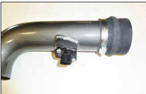
18. Remove the maf sensor from the factory housing and install it into the AEM intake tube and secure with the provided hardware. Install the provided coupler #087121 onto the tube and secure with the provided hose clamp.