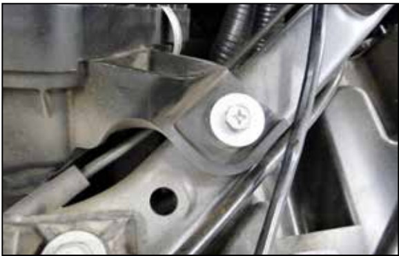
6. Remove the air filter housing front mounting bolt.