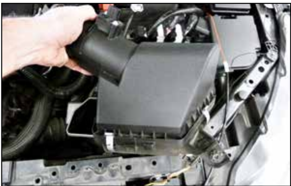
7. Pull up the air filter housing to remove it from the vehicle.