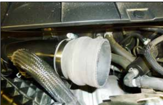
15. Install the hump coupler #08421 onto the end of the factory inlet tube as shown and secure with the provided hose clamp.