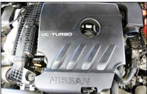
8. Lift up and remove the engine cover.