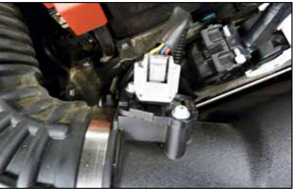
4. Disconnect the mass air sensor electrical connection.