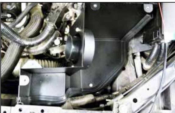
13. Install the heat shield assembly into the vehicle so the mounting posts insert into the factory mounting grommets.