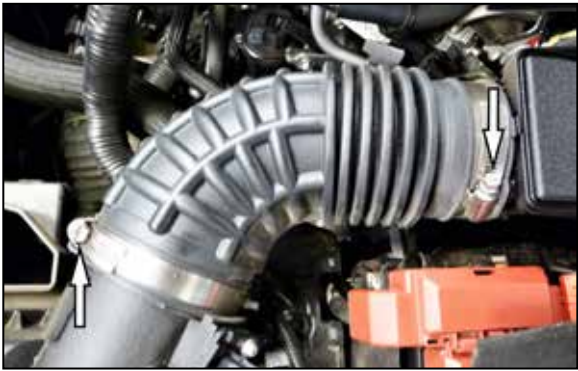
5. Loosen the hose clamps that secure the factory intake tube and then remove the tube from the vehicle.