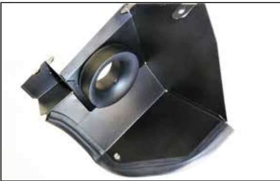
12. Cut a section of edge trim to 18" and install it onto the heat shield as shown.