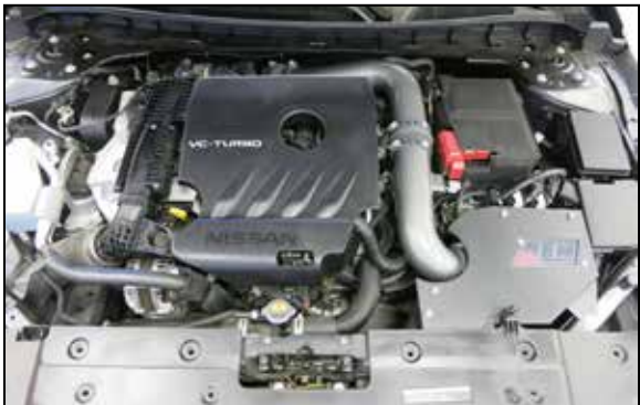
26. Reinstall the radiator cover and secure with the factory retaining pins.