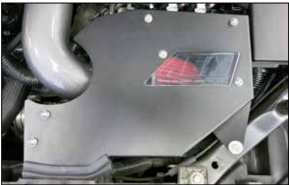
24. Install the lid onto the heat shield using the provided hardware.