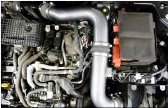
19. Install the front tube front intake tube into the couplers, adjust for best fit and then secure with the provided hose clamps.