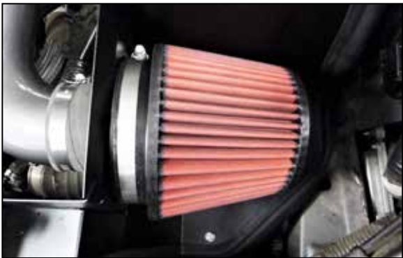
21. Install the air filter onto the filter adapter and secure with the provided hose clamp.