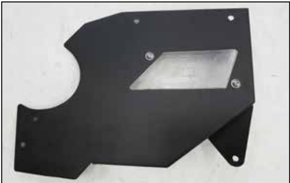
22. Install the AEM window into the heat shield lid using the provided hardware.