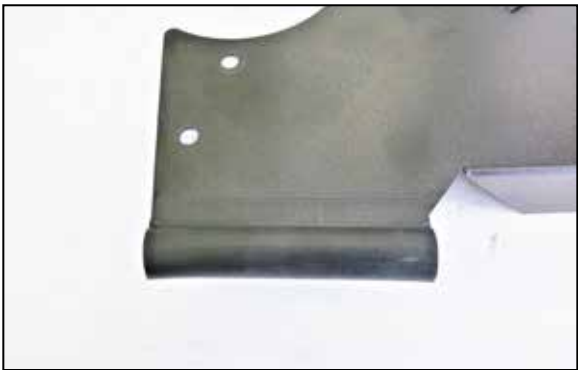
23. Install the remaining 4" edge trim onto the heat shield lid as shown.