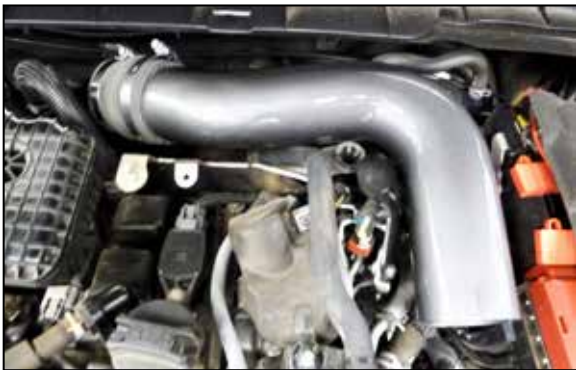
17. Install the rear intake tube into the coupler but do not tighten the hose clamp at this time.