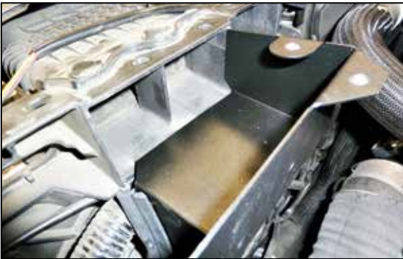
14. Look to make sure that the fresh section of the heat shield is inside the factory fresh air duct.