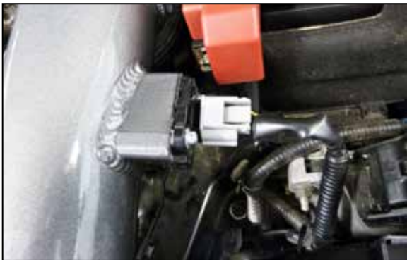
20. Reconnect the maf electrical connection.