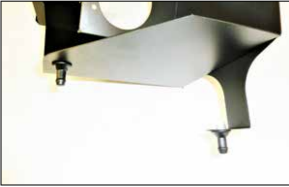
10. Install Mounting posts provided onto the heat shield using the provide hardware.