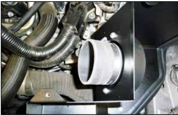
16. Install the provided straight coupler onto the filter adapter and secure with the provided hose clamp.