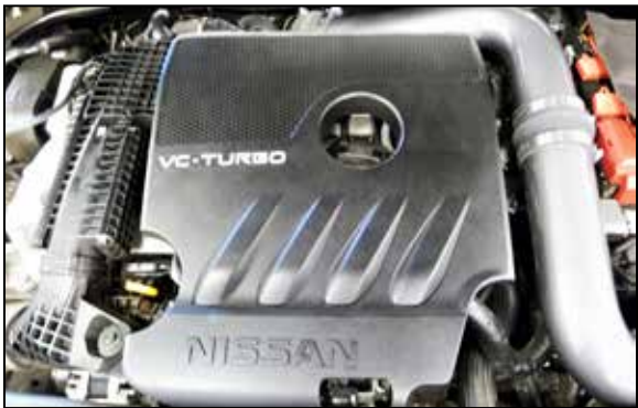
25. Reinstall the engine cover.