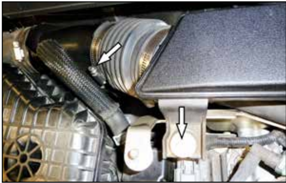
9. Loosen the hose clamp that secures the intake tube and remove the bolt that secures the intake plenum. Then remove the plenum and intake tube.