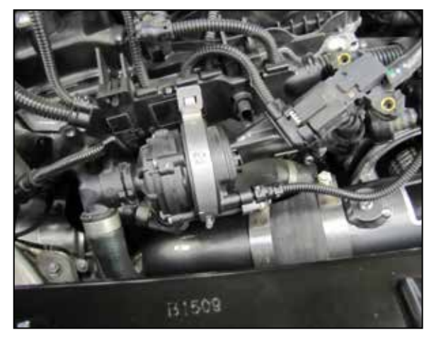
16. Reinstall the coolant pump clamp.