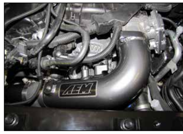
14. Install the upper charge pipe into the coupler and then into the throttle body, secure the tube to the throttle body with the provided hardware and then secure the coupler with the T-bolt clamp. NOTE: It will be necessary to loosen the nut on the clamp completely to allow the clamp to slide onto the coupler, it is a tight fit to secure the coupler tightly against the tube bead.