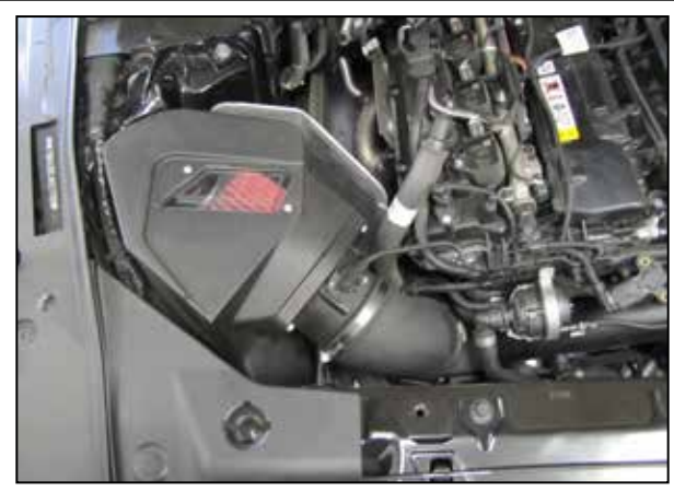
3. Disconnect the inlet air temperature sensor electrical connection and then remove the complete air intake system from the vehicle. NOTE: AEM-21-875DS intake system pictured.