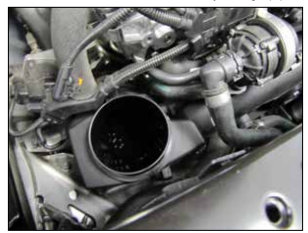
5. Disconnect the CCV vent from the turbo intake plenum, release the retaining clip that secures the plenum onto the turbo inlet and then remove the plenum from the vehicle.