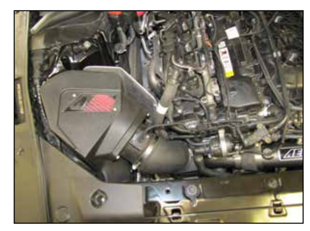
18. Reinstall the intake system into the vehicle and secure to the intake plenum, reconnect the inlet air temperature sensor electrical connection.