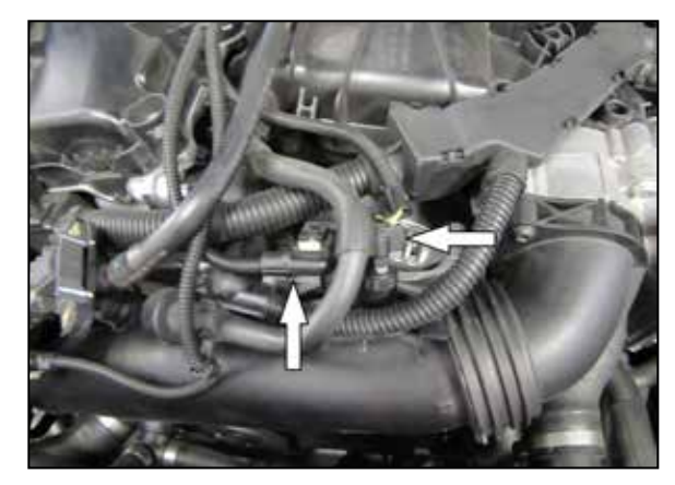
4. Disconnect the electrical connections from the two sensors installed into the factory charge pipe.