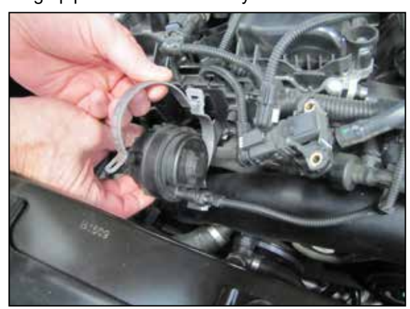
7. Remove the bracket that secures the coolant pump. This pump will not be removed, removing the bracket will aid in the charge pipe removal.