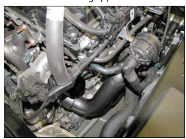
12. Install the AEM lower charge pipe onto the turbo outlet, be sure that the locking clip engages to secure the pipe to the turbo.