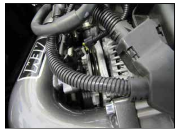
15. Reconnect the two sensor electrical connections. Note: Due to manufacturer tolerance, the wiring harness may need to be adjusted to allow for enough slack in th wiring harness.