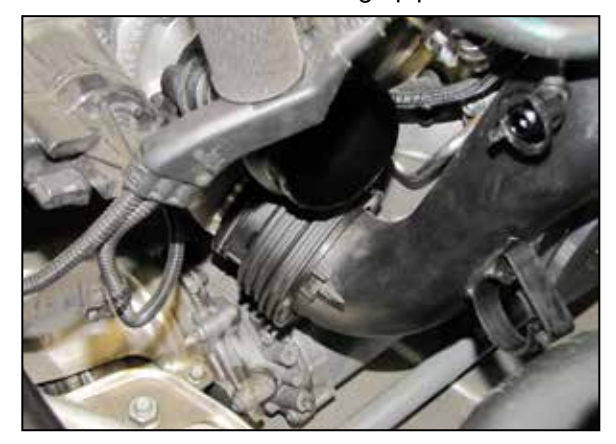
8. Release the locking clip that secures the charge pipe to the turbo outlet, separate the charge pipe from the turbo and remove it from the vehicle.