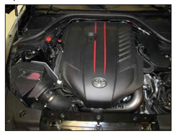
19. Reinstall the engine cover.