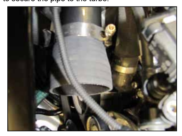
13. Using the provided T-bolt, install the provided step coupler onto the lower charge pipe. NOTE: It will be necessary to loosen the nut on the clamp completely to allow the clamp to slide onto the coupler, it is a tight fit to secure the coupler tightly against the tube bead. It is easier to install the coupler and clamp onto the tube on the bench before the tube is installed into the vehicle.