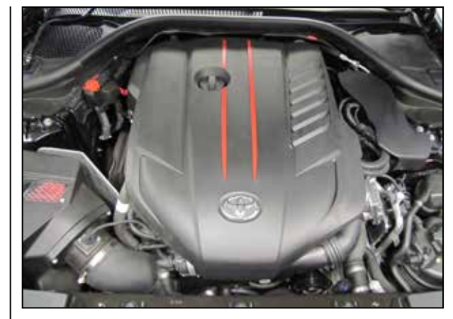
2. Lift up and remove the engine cover from the engine.

NOTE: Disconnecting the negative battery cable erases pre-programmed electronic memories. Write down all memory settings before disconnecting the negative battery cable. Some radios will require an anti-theft code to be entered after the battery is reconnected. The anti-theft code is typically supplied with your owner's manual. In the event your vehicles anti-theft code cannot be recovered, contact an authorized dealership to obtain your vehicles anti-theft code.