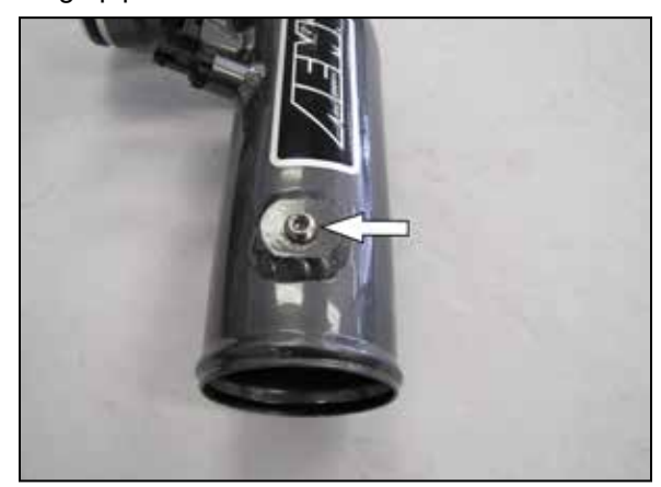
10. Install the 1/8npt pipe plug into the water injection port. NOTE: be sure to use pipe tape or other pipe sealant on the threads of the plug (not supplied).