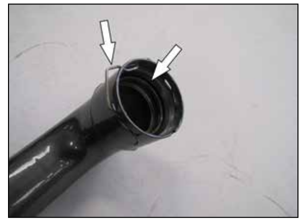
11. Remove the retaining clip and O-ring from the lower section of the factory charge pipe and install them onto the AEM charge pipe as shown.