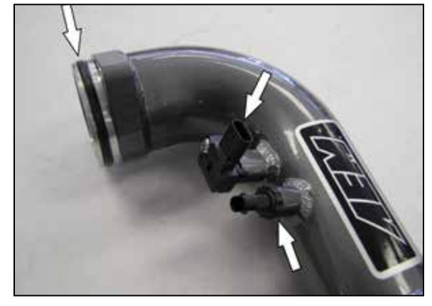
9. Remove the two sensors and O-ring from the factory charge pipe and install them onto the AEM charge pipe as shown.