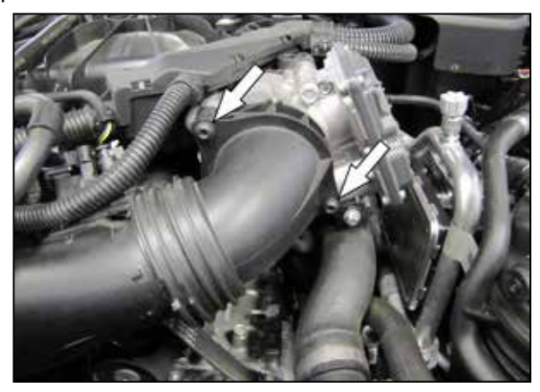
6. Remove the two bolts that secure the factory charge pipe to the throttle body.