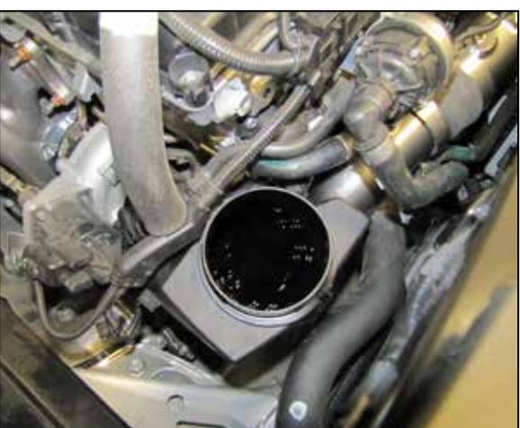
17. Reinstall the turbo inlet plenum being sure the retaining clip snaps into the groove to secure the plenum to the turbo. Reconnect the CCV vent to the plenum.