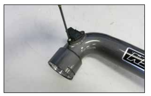
9. Install the pressure sensor into the AEM charge tube and secure with the provided hardware.