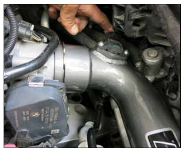
15. Snap the throttle body side quick connect coupler onto the throttle body. Be sure the retaining ring is fully locked. Reconnect the pressure sensor electrical connection.