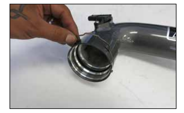
10. Install the O-rings and retaining clips into the AEM charge pipes.