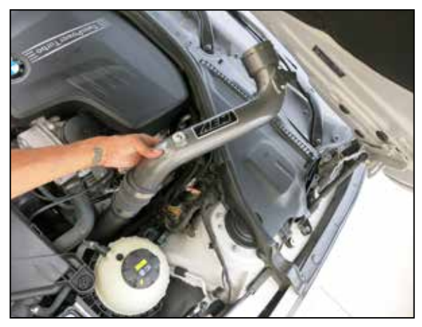
14. Feed the charge tube into the vehicle and align with the throttle body and intercooler connections.