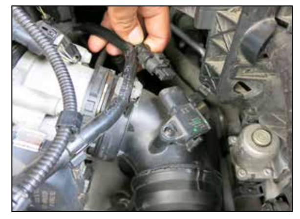
5. Disconnect the pressure sensor electrical connection.