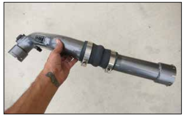
13. Assemble the two sections of charge tube with the provided hump coupler and clamps loosely to allow for adjustment.