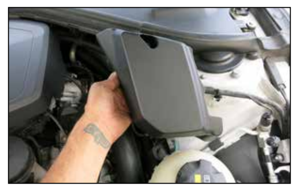
4. Remove the screw that secures the ECU cover and then remove the cover from the vehicle.