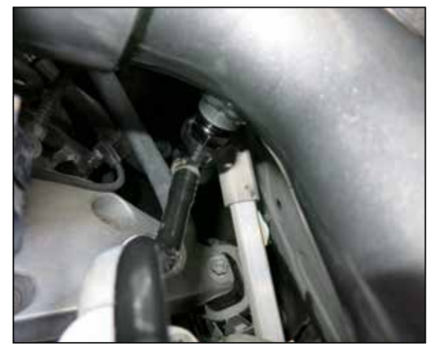
16. Connect the CCV pipe to the fitting installed into the AEM charge tube.