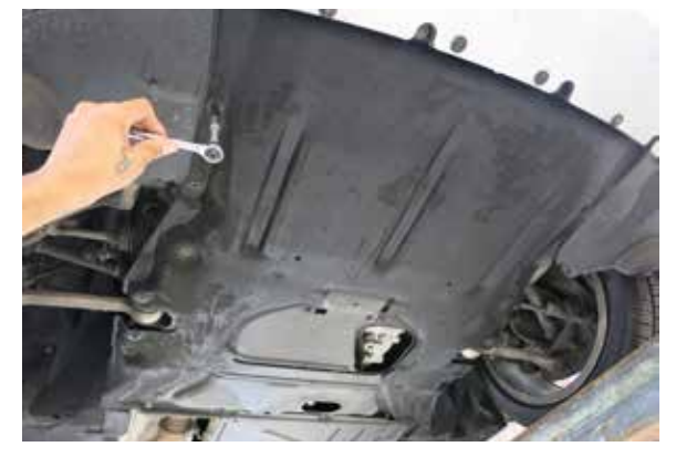
2. With the vehicle secured on jack stand or lift, remove the screws that secure the lower valence to the vehicle and then remove the valence.

NOTE: Disconnecting the negative battery cable erases pre-programmed electronic memories. Write down all memory settings before disconnecting the negative battery cable. Some radios will require an anti-theft code to be entered after the battery is reconnected. The anti-theft code is typically supplied with your owner's manual. In the event your vehicles anti-theft code cannot be recovered, contact an authorized dealership to obtain your vehicles anti-theft code.