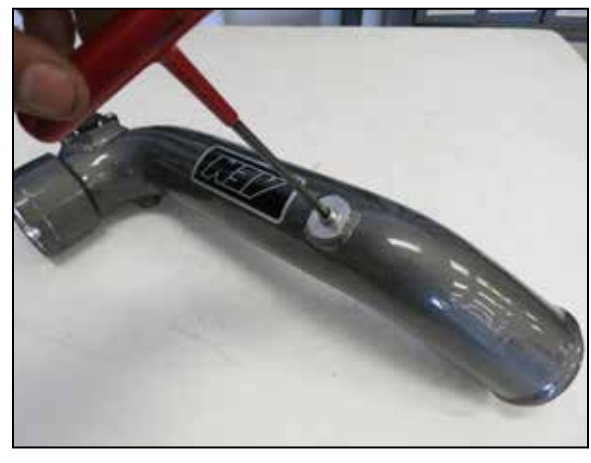
11. Install the provided 1/8npt pipe plug into the accessory port. Be sure to use pipe sealant or Teflon tape on the threads.