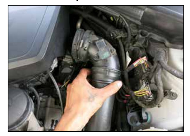
7. As the factory charge tube is removed from the vehicle, disconnect the CCV pipe from the underside of the charge tube and then completely remove the charge tube from the vehicle.