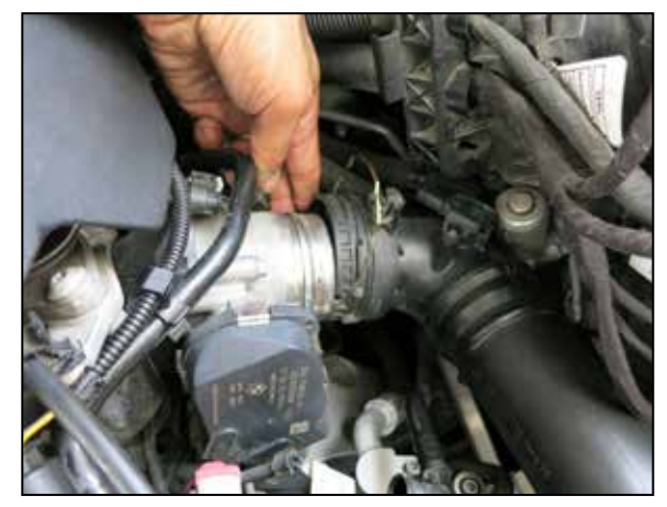
6. Disconnect the CCV hose from the factory charge tube clip. Release the retaining clip that secures the upper quick connect coupler to the throttle body and then separate the charge tube from the throttle body.