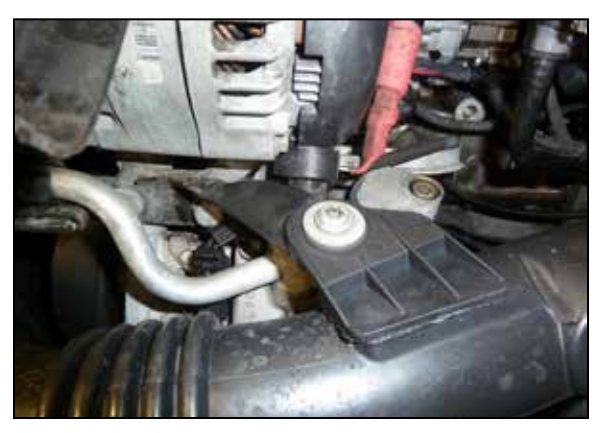
10. Remove the bolt securing the charge tube to the bracket.