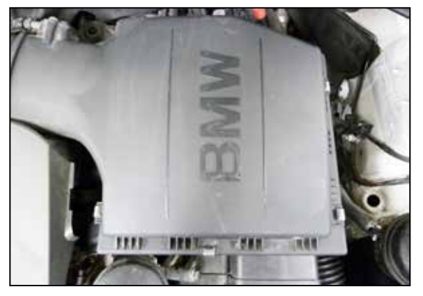
4. Release the clips that secure the upper air filter housing and then remove the housing and air filter.