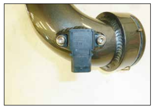
13. Remove the screws securing the pressure sensor and then remove the sensor and install it into the AEM charge tube and secure with the provided hardware.