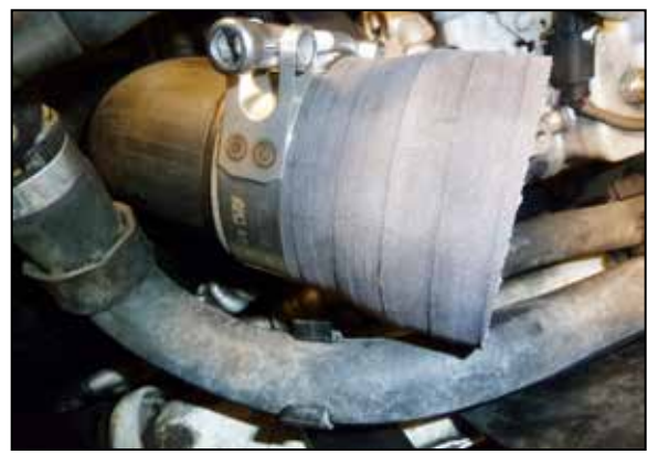
15. Install the provided coupler onto the intercooler port.