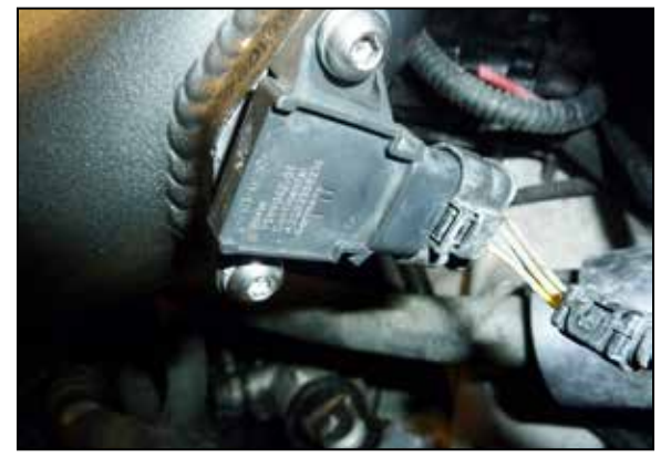
18. Reconnect the pressure sensor electrical connection.

17. Tighten the hose clamps to secure the coupler.