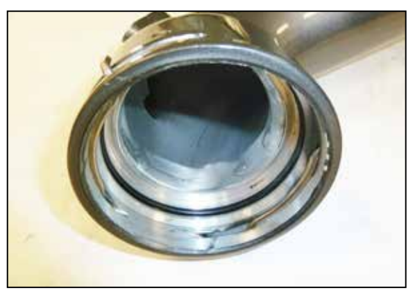
12. Remove the retaining clip and O-ring from the factory tube and install them onto the AEM charge tube.