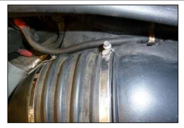
3. Loosen the hose clamp that secures the intake hose to the air filter housing.

2. Disconnect the maf sensor electrical connection.