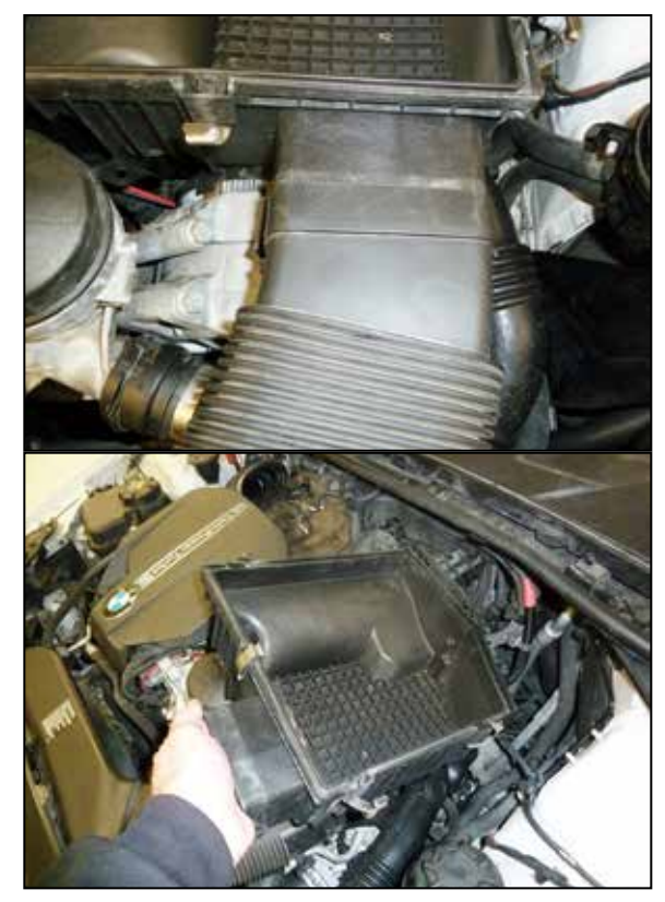
7. Remove the lower air filter housing from the vehicle.