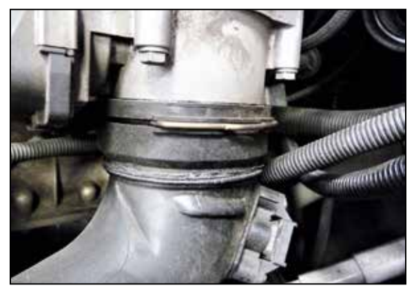
11. Release the spring clip securing the charge tube to the throttle body. Remove the charge tube from the vehicle.