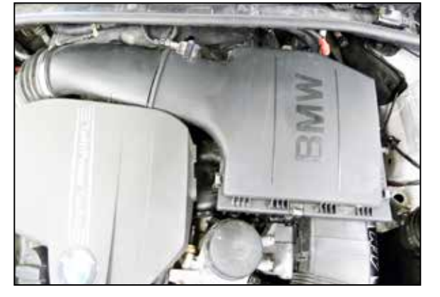
20. Reinstall the air filter and upper air filter housing.