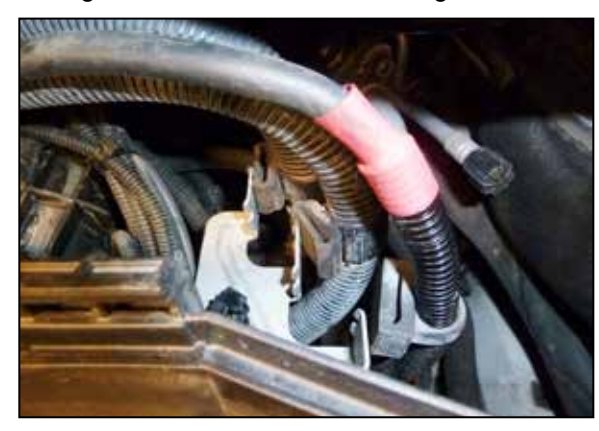
5. Unhook the harness from the rear of the lower air filter housing.