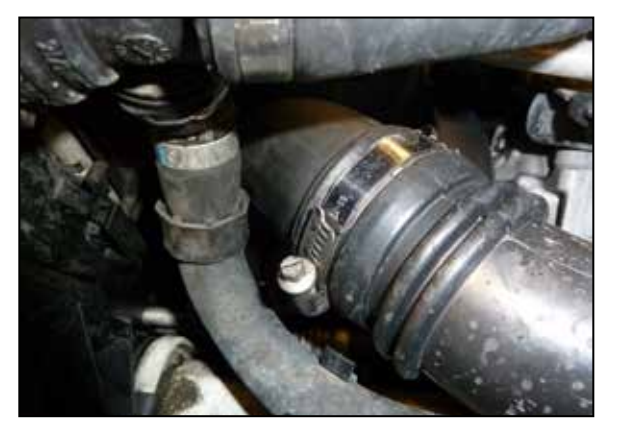
9. Loosen the hose clamp that secures the charge tube to the intercooler outlet.

8. Disconnect the pressure sensor electrical connection.