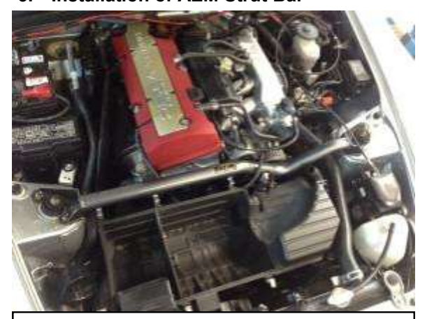
a. Place the AEM strut tower bar over shock studs, replace and tighten damper nuts.