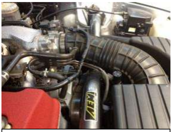
g. On some cars, the metal vacuum lines may need adjustment for clearance