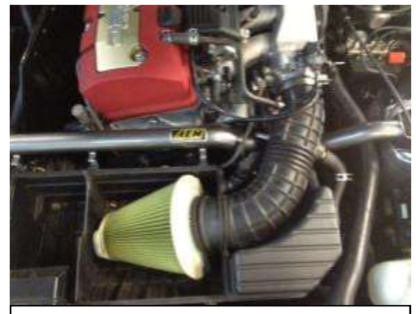
b. Re-install the intake tube/air filter assembly.