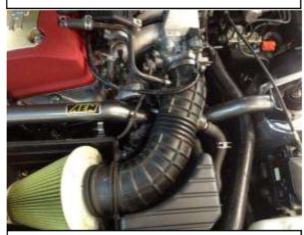
d. Re-connect AIT sensor wire, clip sensor wires back to intake the intake tube.