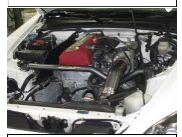
f. AEM strut bar installed with an AEM intake (not included).