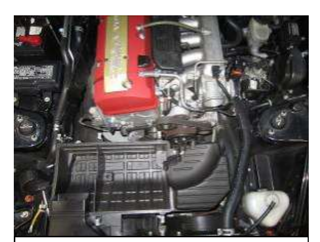
c. Unplug AIT sensor, unclip sensor wires from the intake tube. Loosen the clamp holding the vent tube to the intake tube, and remove the intake tube/air filter assembly.