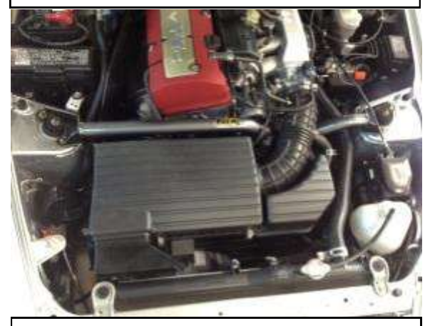
e. Replace and secure the airbox cover.