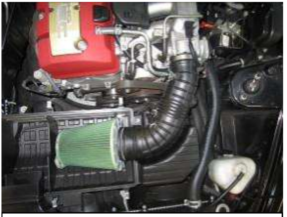
a. Unclip and remove the airbox cover.