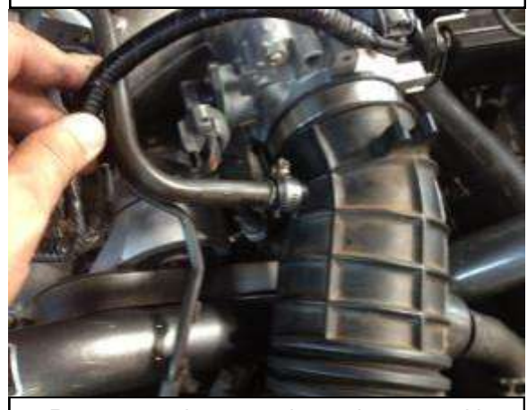
c. Re-connect the vent tube and secure with the clamp.