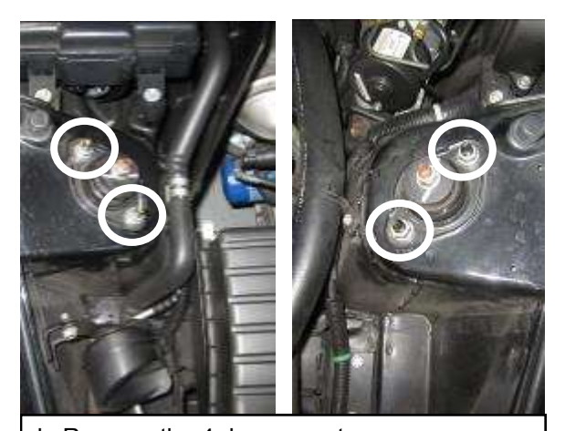
d. Remove the 4 damper nuts.