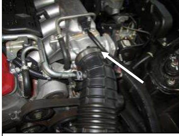
b. Loosen the clamp holding the intake tube to the throttle body.