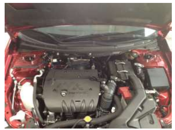
a. With the car on the ground, use a 14mm socket to remove the (6) strut top nuts.