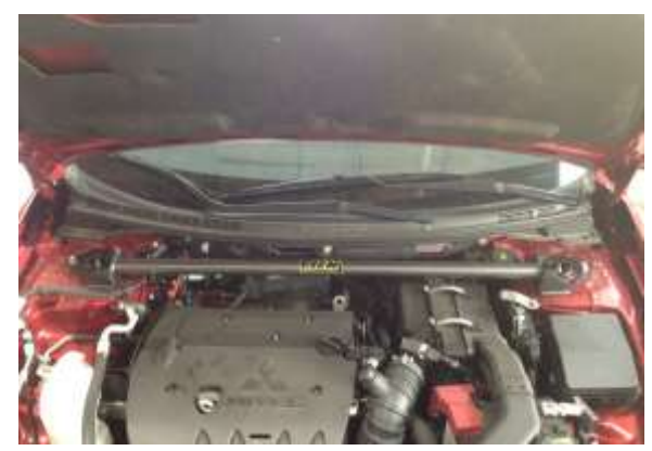
b. Install the AEM Strut Bar, and using a 14mm socket, replace the strut tower nuts.