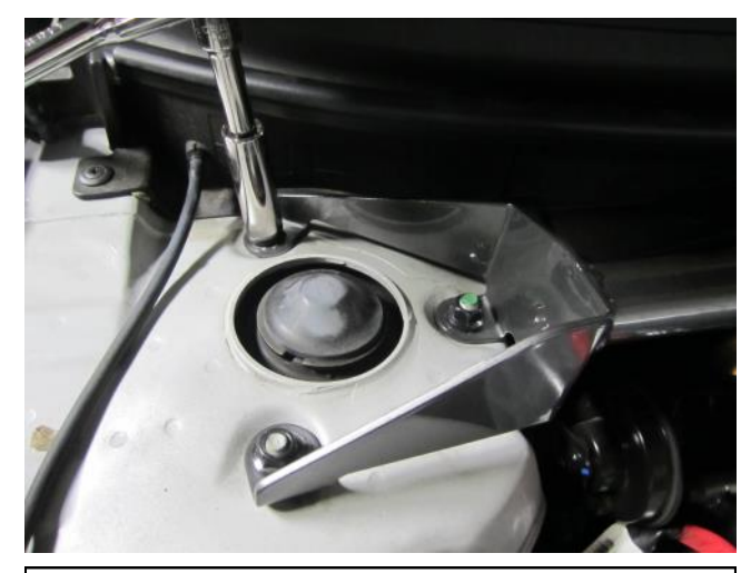
a. Install the AEM Strut Tower Bar, re-install the strut tower nuts, and torque to 43.4 ft-lb.