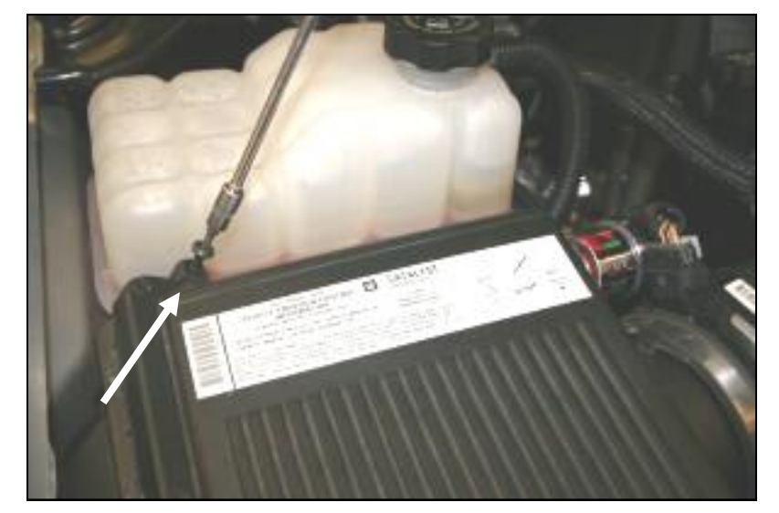
7. If you purchased the 200-996 kit, proceed to step # 9. If you purchased a Jr. Kit, remove 4 screws in the factory airbox with a #25 Torx bit, and remove the factory air filter. Proceed to step #8.