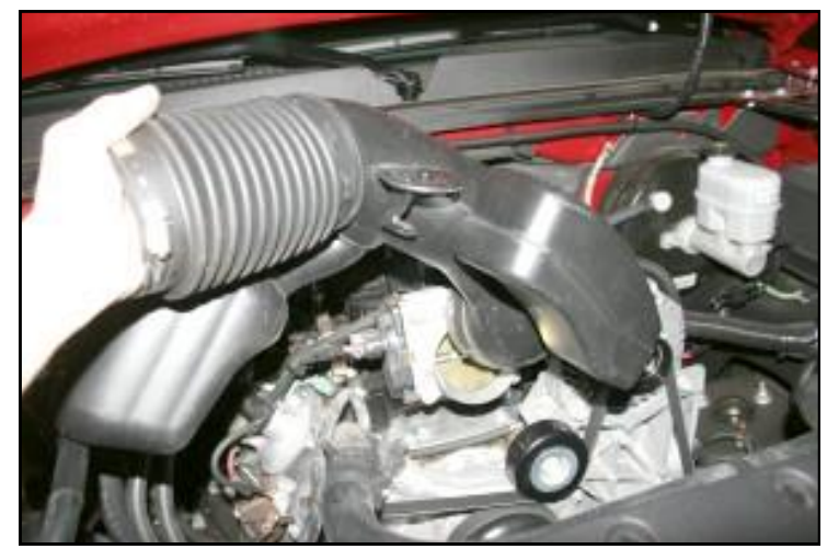
5. Slide the factory intake tube off of the MAF sensor, rotate it up so that it disengages from the mounting grommet on the intake manifold, and then slide it forward off of the throttle body and remove it from the vehicle.