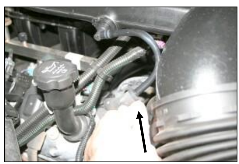
2. Disconnect the factory breather hose at the valve cover.