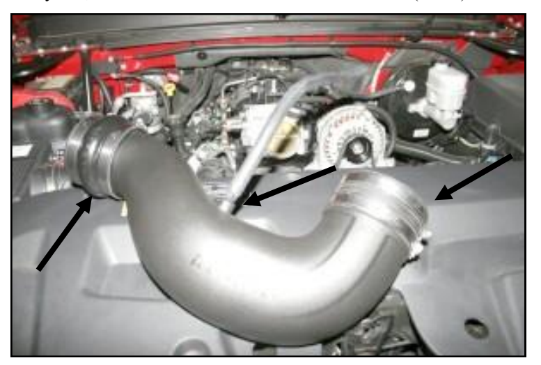
6. Install the urethane coupler on the throttle body end of the Modular Intake Tube with two #64 hose clamps. Install the urethane hump hose on the other end of the MIT with the remaining two #64 hose clamps. Leave all clamps loose for now. Install the 3/8" barbed fitting into the MIT, and slide the 3/8" breather hose over the barbed fitting as shown.