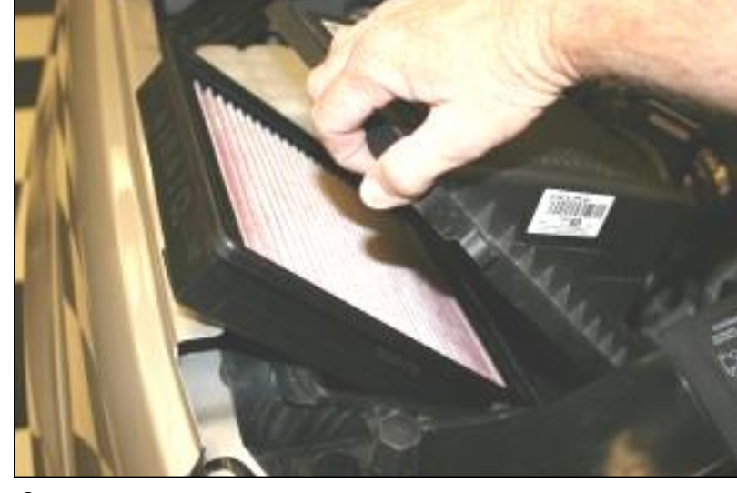
8. Install the Airaid Premium filter into the factory airbox, and re-install the 4 screws.