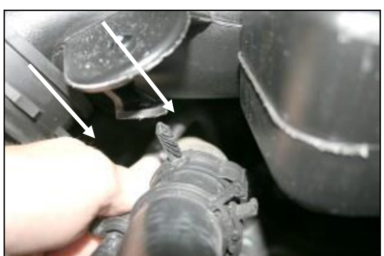
\bf 3. Separate the factory intake tube from the plastic clamp barb that secures the radiator hose to the tube. A firm downward push will usually do it.

Remove the factory beauty cover by lifting up on the front, and then pulling the cover towards the front of the vehicle. It is only held in place by grommets.