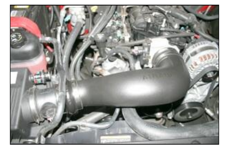
9. Install the MIT onto the MAF first, and then onto the throttle body. Adjust for fit, and tighten the hose clamps. Next connect the breather hose to the factory breather port on the valve cover. Reinstall the factory hose clamp barb back into the hole in the bottom of the MIT . Reinstall the engine cover.