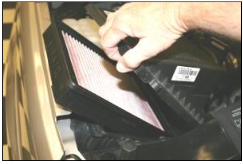
8. Install the Airaid Premium filter into the factory airbox, and re-install the 4 screws.