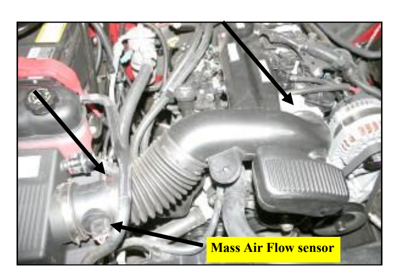
4. Loosen two hose clamps on the factory intake tube. One at the throttle body end, and the other at the Mass Air Flow sensor (MAF) end.