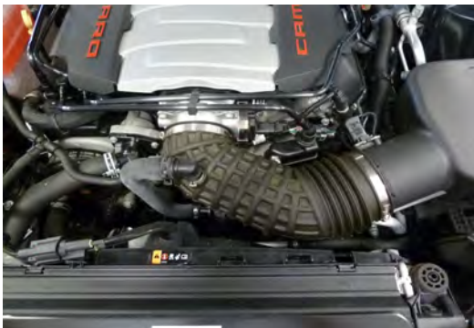
1. Disconnect the negative battery cable!