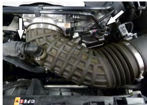
2. Disconnect the two hoses from the intake tube. Loosen the two hose clamps and remove the air intake tube.