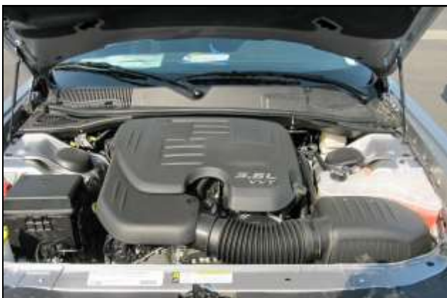
7. Reinstall the intake tube and engine cover in the reverse order that they were removed. Make sure to reconnect the temperature sensor.