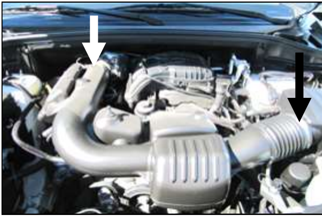
3. Loosen the clamps on both ends of the intake tube, and remove from the engine compartment.