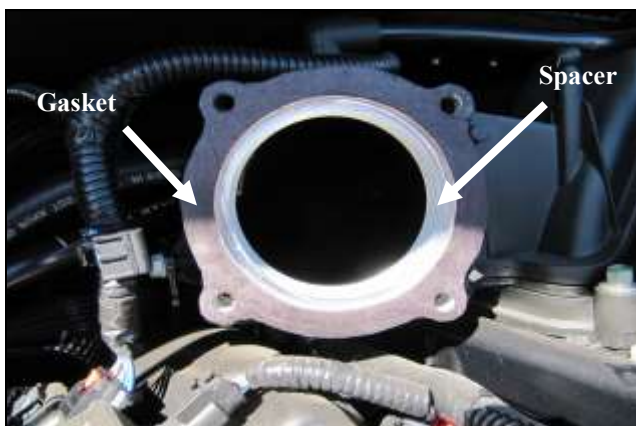
5. Insert the Airaid spacer into the intake manifold. The gasket will go between the spacer and the throttle body. *Note: Airaid spacer must be installed with bore protruding into intake manifold away from throttle body. Incorrect installation will hinder performance. Reference picture below for spacer orientation.