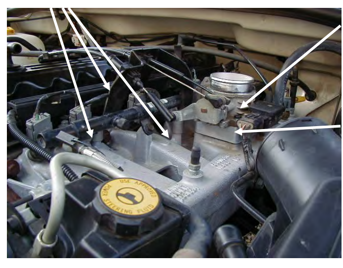
<u>Ref. C</u>- (3) Spacers 1" (3) 6mm x 40mm Bolts