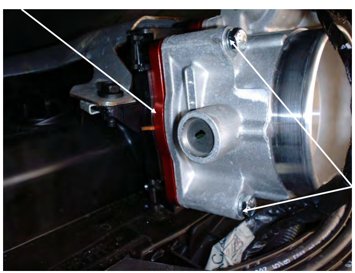
Ref. "A"- (1) Power Plate (1) "O"-Ring