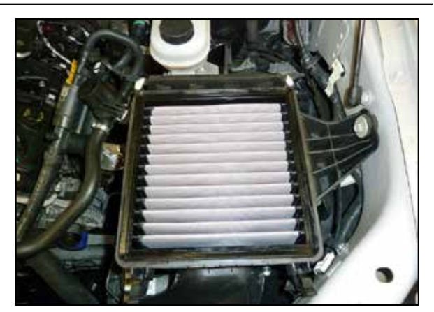
5. Install the provided AIRAID® air filter and reinstall the factory upper air filter housing.