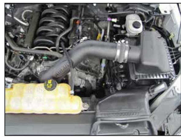
10. Double check your work! Make sure there is no foreign material in the intake path. Make sure all clamps, hoses, bolts, and screws are tight. Double check the hood clearance! Reconnect the negative battery cable!

Thank you for purchasing the Airaid Intake System. Contact Airaid @ (800) 498-6951 8:00 AM - 5:00 PM MST weekdays for questions regarding fit or instructions that are not clear to you. Your Airaid Intake System was carefully inspected and packaged. Check that no parts are missing, or were damaged during shipping. If any parts are missing, contact Airaid. The air filter element is protected from direct exposure to water and debris; care should be taken not to drive through deep water. WATER INGESTION IS THE DRIVERS RESPONSIBILITY! The air filter is reusable and should be cleaned periodically.