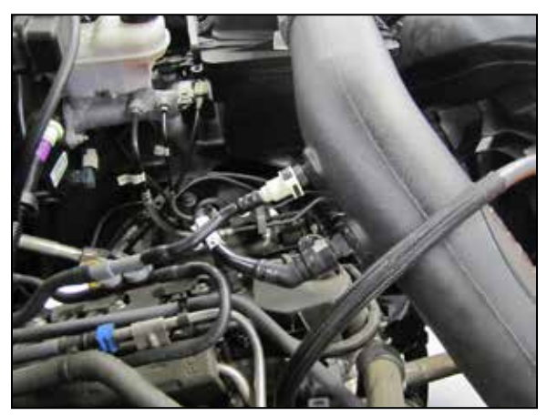
9. Connect the EVAP and crank case vent lines to the quick connect fittings installed into the AIRAID® intake tube.