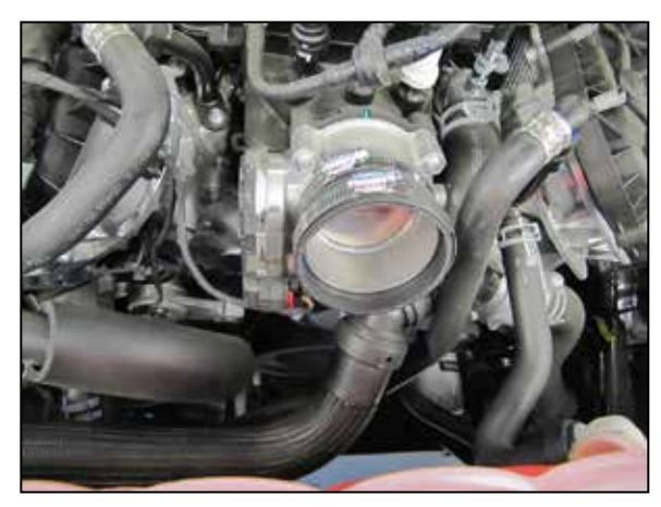
7. Install the provided coupler hose (08615) onto the throttle body and secure with the provided hose clamp.