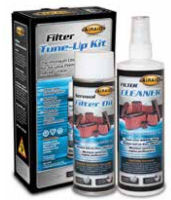
P/N 790-551 Aerosol Spray P/N 790-550 Squeeze Spray