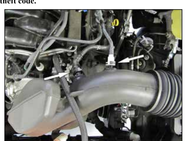
2. Disconnect the EVAP and crank case vent quick disconnect fittings.

NOTE: Disconnecting the negative battery cable erases pre-programmed electronic memories. Write down all memory settings before disconnecting the negative battery cable. Some radios will require an anti-theft code to be entered after the battery is reconnected. The anti-theft code is typically supplied with your owner's manual. In the event your vehicles anti-theft code cannot be recovered, contact an authorized dealership to obtain your vehicles anti-