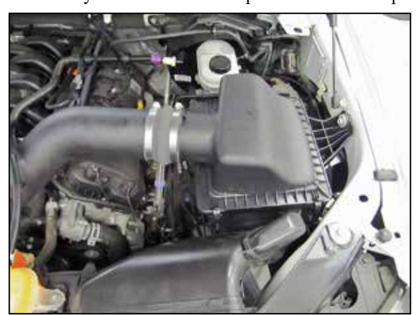
8. Install the AIRAID® intake tube into the coupler at the air filter housing and then into the coupler at the throttle body, adjust the tube for best fit and then secure with the provided hose clamps.