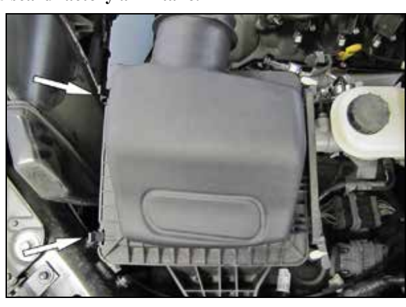
4. Release the two clips that secure the upper air filter housing and then remove the upper housing and factory air filter.

NOTE: AIRAID recommends that customers do not discard factory air intake.