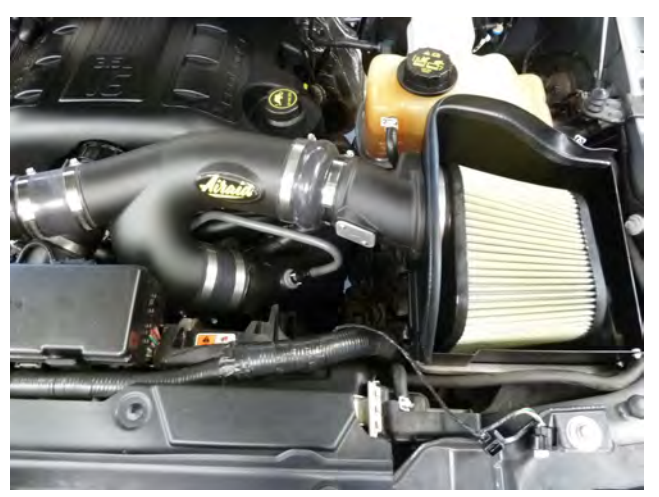
15. Double check your work. Make sure there is no foreign material in the intake path. Make sure all clamps, hoses, bolts, and screws are tight. Double check the hood clearance. Reconnect the negative battery cable.

Thank you for purchasing the Airaid Intake System. Contact Airaid @ (800) 498-6951 8:00 AM - 5:00 PM MST weekdays for questions regarding fit or instructions that are not clear to you. Your Airaid Intake System was carefully inspected and packaged. Check that no parts are missing, or were damaged during shipping. If any parts are missing, contact Airaid. The air filter element is protected from direct exposure to water and debris; care should be taken not to drive through deep water. WATER INGESTION IS THE DRIVERS RESPONSIBILITY! The air filter is reusable and should be cleaned periodically.