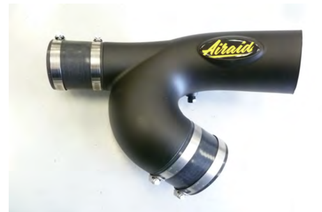
4. Slide the Couplers and Clamps onto the Intake tube as