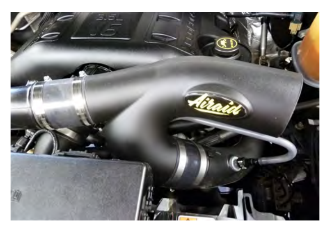
5. Install the Airaid Intake Tube onto the factory turbo