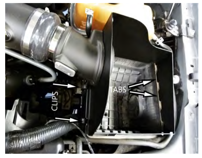
12. Install the Tube and Panel assembly onto the Airaid Intake Tube first, then insert the Panel tabs into the factory air box slots. Adjust the assembly until the OEM air box clips can positively engage the Panels and lock.

11. Slide the Hump Hose and Clamps onto the Sensor Tube a shown.