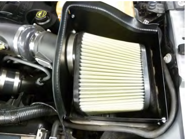
14. Install the Airaid Premium Filter onto the Sensor Tube and tighten the clamp.