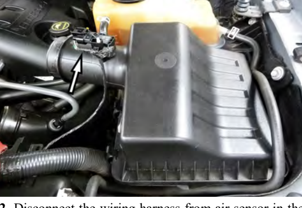
2. Disconnect the wiring harness from air sensor in the air box lid. Unclip the air box lid and remove it and the factory air filter from the vehicle. The lower half of the factory air box is to remain in the vehicle.