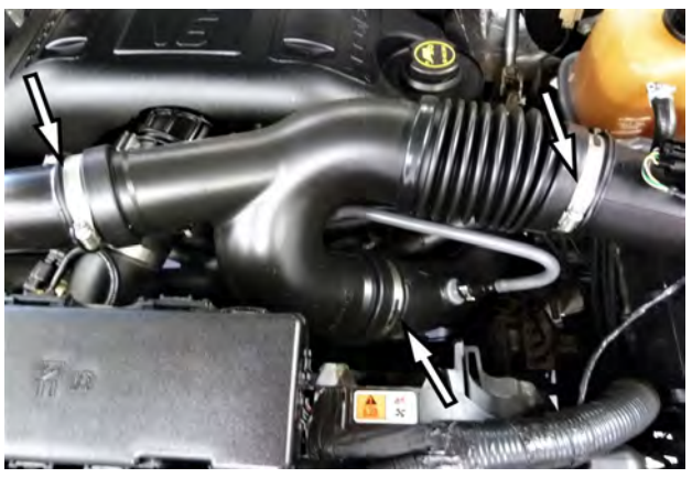
1. Disconnect The Negative Battery Terminal. Loosen the 3 clamps on the factory intake tube and remove it from the vehicle. NOTE: 2011 models will have a vacuum line attached to

the underside of the intake tube that will need to be dis-