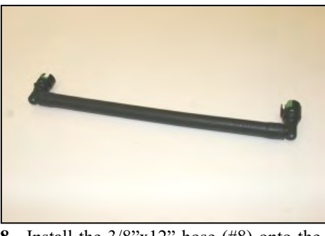
18. Install the 3/8"x12" hose (#8) onto the factory breather ends as shown.

21. Reconnect the negative battery cable!