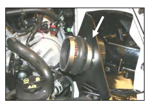
10. Install the hump hose (#5) on the filter adapter (#6), with two #72 hose clamps (#13). Tighten <u>only</u> the clamp next to the CAD .