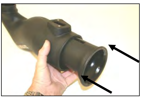
12. Install the Modular Venturi Tube (MVT) (#3) into the Airaid Intake Tube (#2) as shown. (SEE #22 BELOW!!)