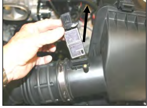
5. Using the provided #20 torx bit, remove two screws and the mass air sensor from the factory airbox lid. Note the direction of the sensor for proper re-installation later. (Save the mass air sensor for re-installation in step #13, the factory screws will not be re-used).