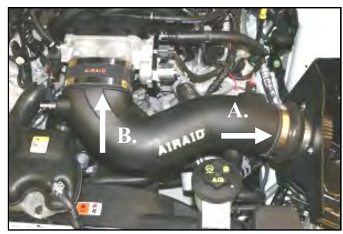
15. A.) Install the tube into the hump hose. B.) Now slide the oval coupler onto the throttle body. Tighten the remaining two hose clamps, and re-connect the mass air sensor, from step #2.

20. Double check your work! Make sure there is no foreign material in the intake path. Make sure all clamps, hoses, bolts, and screws are tight. Double check the hood clearance!