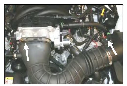
2. Loosen the intake tube hose clamp on the throttle body. Slide the red tab on the electrical connector, and disconnect the mass air sensor.