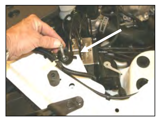
6. With a 10mm socket, remove and save the bolt from the anti-lock brake bracket. It will be re-installed later in step #8.