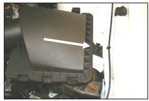
3. With a 10mm socket, remove the bolt holding the factory airbox to the fender and save the bolt. It will be reused