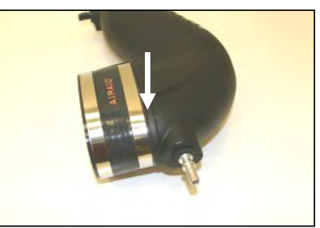
14. Install the oval coupler (#4) with two #72 hose clamps (#13). Tighten <u>only</u> the clamp closest to the aluminum fitting. ( Hint: For a clean look, locate the hose clamp tightening screws under the tube )!