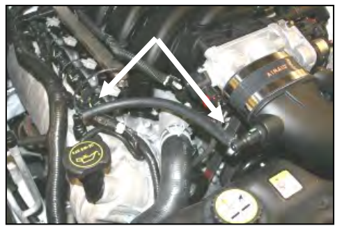
19. Re-connect the breather line (#8) back to the factory locations as shown.