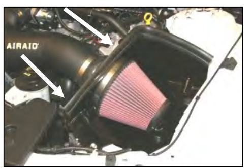
16. Install the Airaid Premium Filter (#1) onto the filter adapter, and tighten the clamp. Install the weather strip (#9) on the top of the CAD as shown.