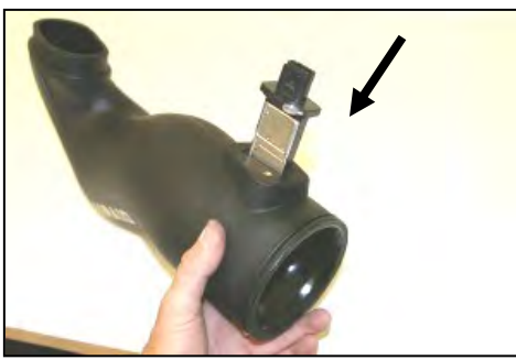
13. Align the two slots in the tubes, and install the factory mass air sensor removed from step #5. Make sure the screw holes line up, then install the two supplied button head screws. (#12). DO NOT USE THE FACTORY SCREWS!!