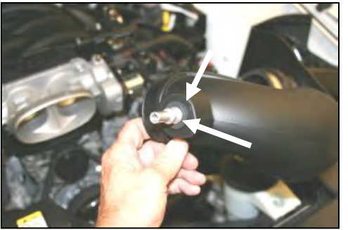
11. Install the supplied grommet (#14) and aluminum fitting (#17) into the Airaid intake tube as shown.