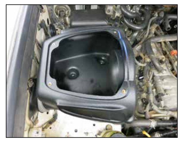
17. Install the AIRAID air filter housing into the vehicle and secure to the factory filter housing mounting location with the provided hardware. Note: Be sure that the ground wire is secured back in its original location and secured with the filter housing.