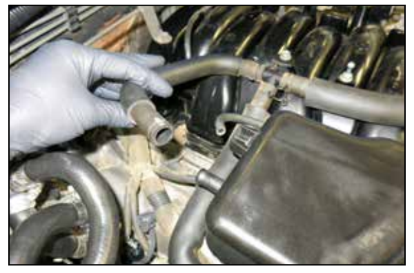
3. Disconnect the CCV vent hose and fuel pressure vent line from the plenum.