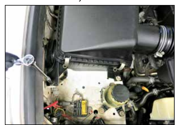
6. Loosen the two front air filter housing mounting bolts.