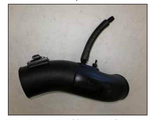
13. Install the provided CCV hose and fitting onto the intake tube as shown.