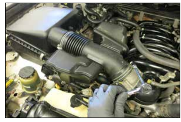
5. Loosen the hose clamp that secures the intake tube to the throttle body.