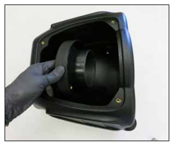
14. Install the filter adapter into the AIRAID filter housing and secure with the provided hardware.