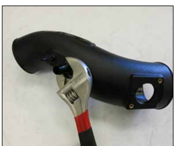
10. Install the provided vent fittings into the AIRAID intake tube as shown.