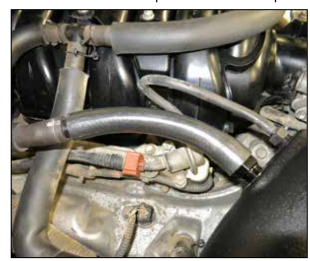
19. Connect the CCV hose and fuel pressure regulator vent hose.