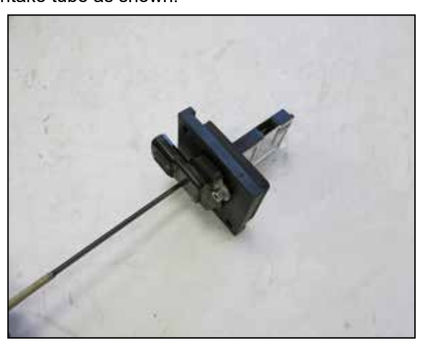
11. Remove the MAF sensor from the factory air filter housing and install it into the provided filter adapter with the hardware provided. Then install the provided gasket onto the bottom of the adapter.