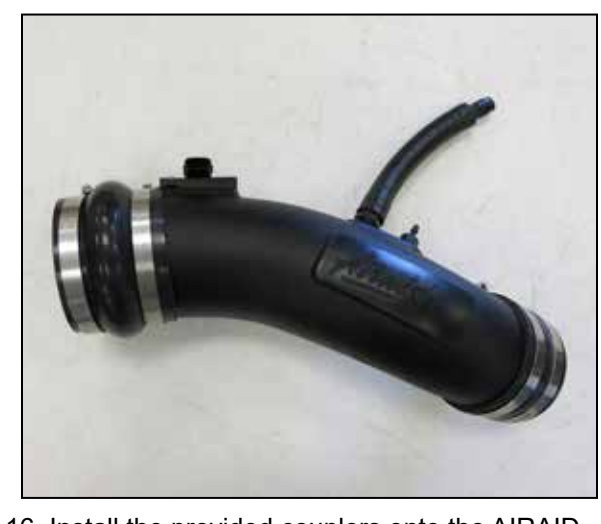
16. Install the provided couplers onto the AIRAID intake tube using the provided hose clamps.