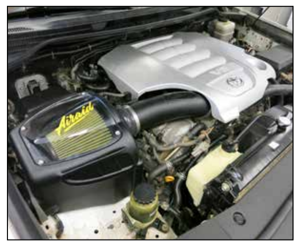
23. Double check your work! Make sure there is no foreign material in the intake path. Make sure all clamps, hoses, bolts, and screws are tight. Double check the hood clearance! Reconnect the negative battery cable!

Thank you for purchasing the Airaid Intake System. Contact Airaid @ (800) 498-6951 8:00 AM - 5:00 PM MST weekdays for questions regarding fit or instructions that are not clear to you. Your Airaid Intake System was carefully inspected and packaged. Check that no parts are missing, or were damaged during shipping. If any parts are missing, contact Airaid. The air filter element is protected from direct exposure to water and debris; care should be taken not to drive through deep water. WATER INGESTION IS THE DRIVERS RESPONSIBILITY! The air filter is reusable and should be cleaned periodically.