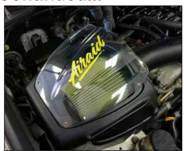
22. Install the AIRAID air filter housing cover and secure with the provided hardware.