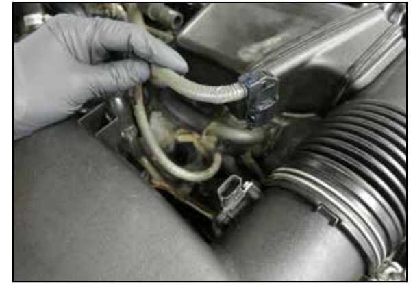
4. Disconnect the MAF sensor electrical connection and unhook the wiring from the air filter housing.