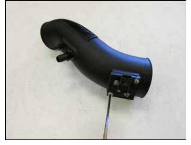
12. Install the MAF sensor assembly into the intake tube and secure with the provided hardware.