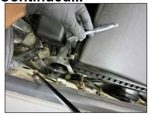
7. Loosen the rear air filter housing mounting bolt.