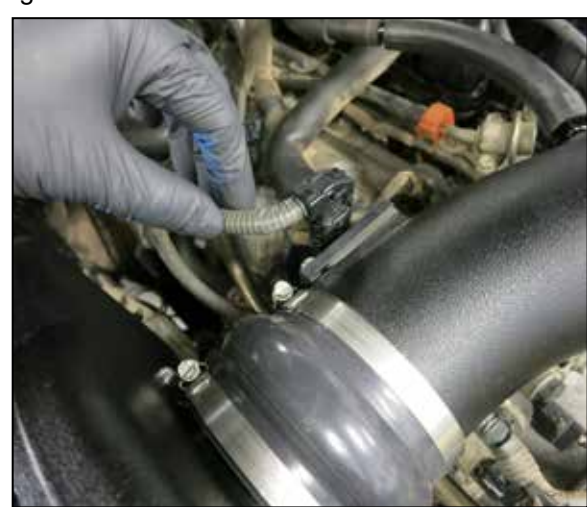
20. Reconnect the MAF electrical connection.