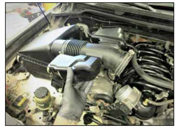
8. Remove the complete factory intake system from the vehicle.