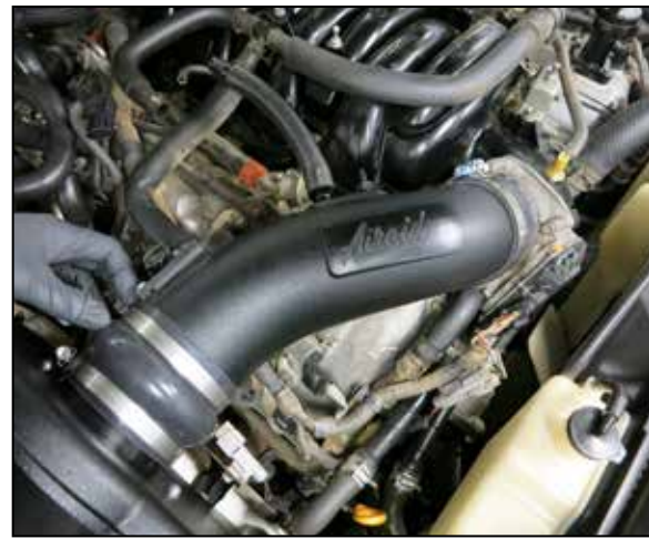
18. Install the intake tube assembly onto the throttle body and filter adapter, adjust for best fit and then secure with the provided hose clamps.