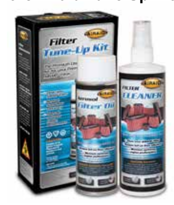
P/N 790-551 Aerosol Spray P/N 790-550 Squeeze Spray