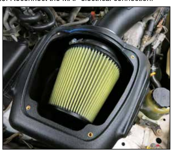
21. Install the air filter onto the adapter and secure with the provided hose clamp.