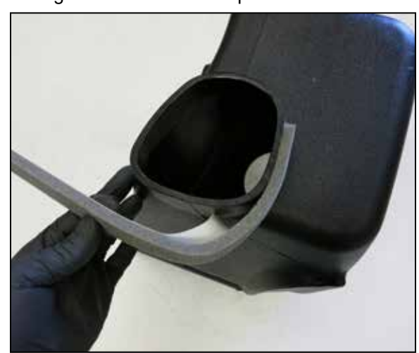
15. Install the foam inlet seal around the AIRAID fresh air inlet.