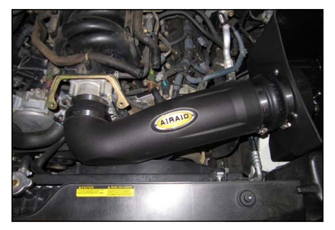
10. Install the Airaid Intake Tube into the Hump Hose first, and then into the Reducing Coupler. Adjust for fit, and tighten all four Hose Clamps.