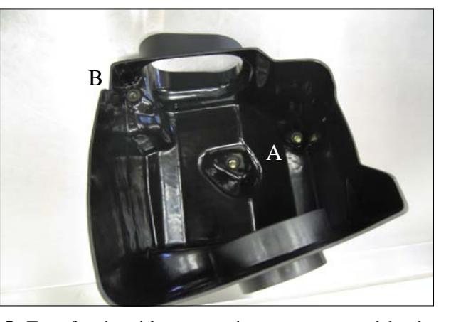
5. Transfer the airbox mounting grommets and hard-