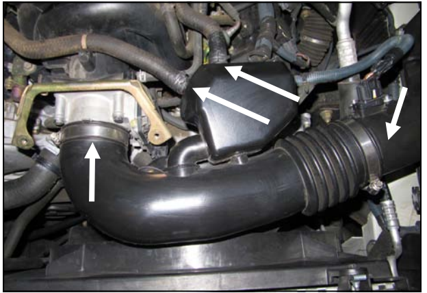
2. A.) Using a pair of pliers, compress the spring clamps on the PCV breathers and them slide back. Disconnect the breathers from the factory intakeB.) Loosen the two clamps on the factory intake tube and remove it from the vehicle.