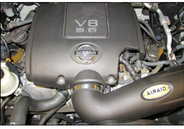
17. Reinstall the engine cover in the reverse order in which it was removed, rear first, front last. Only now it is to be secured using the two Acorn Nuts (#11) and two 1/4" flat washers.

18. Double check your work! Make sure there is no foreign material in the intake path. Make sure all clamps, hoses, bolts, and screws are tight. Double check the hood clearance!