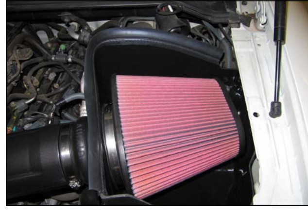
16. Install the Airaid Premium Filter (#1) onto the Filter Adapter then install the Weather Strip (#7) onto the top of the Cold Air Box with the contour rolling away from the Filter.

15. Reinstall the bracket onto the intake manifold and place a Spacer (#13) onto each 6mm bolt.