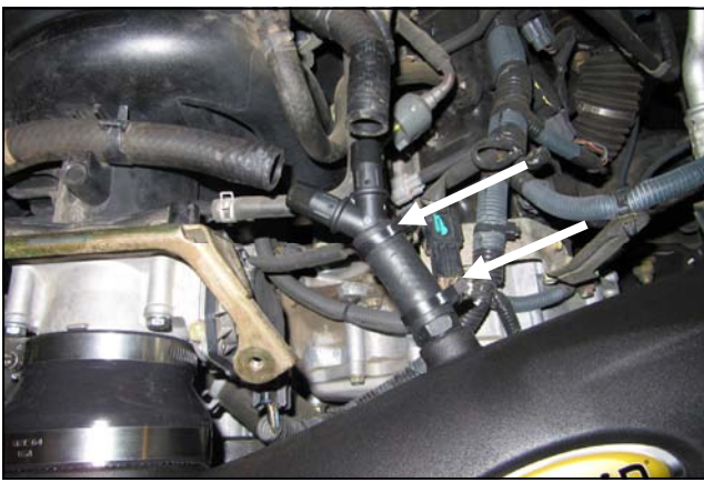
11. Install the 5/8" Hose (#16) onto the Barbed fitting in the Intake Tube. Insert the Barbed "Y" Fitting (#14) into the 5/8" Hose and secure using the two Speed Clamps (#17).