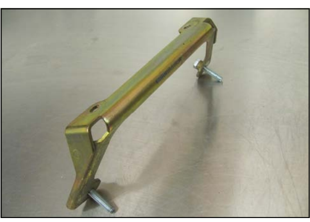
14. Remove the factory engine cover mounting bracket from the intake manifold and install the two 6mm x30mm Bolts (#10) as shown. They are to be installed from behind and protrude forward when installed properly.