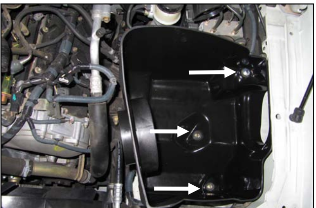
6. Set the CAB assembly inside the engine compartment,