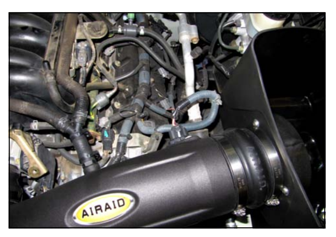
12. Reconnect the factory PCV breathers and spring clamps to the Barbed "Y" Fitting. Reconnect the Mass Air Flow sensor.