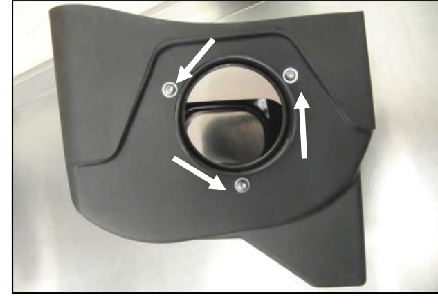
4. Install the Filter Adapter (#4) onto the Cold Air Box

3. Disconnect the Mass Air Flow sensor, or MAF, and separate the wiring harness from the airbox lid. Using a 10mm socket, remove the single bolt securing the airbox. Lift straight up on the airbox assembly and unseat it from the mounting grommets on the inner fender. 4WD models will need the differential breather disconnected from the airbox lid.