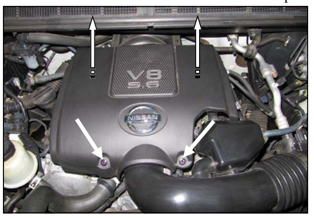
Disconnect The Negative Battery Terminal! 1. Using a 10mm socket, remove the two front engine cover bolts. Lift straight up on the cover and unseat the rear half from it's mounting grommets.

ll color instructions can be viewed on our web site at Airaid.com. If you need <u>any</u> assistance please call 1-800-858-3333 to speak with a representative in our Customer Service Center before returning the