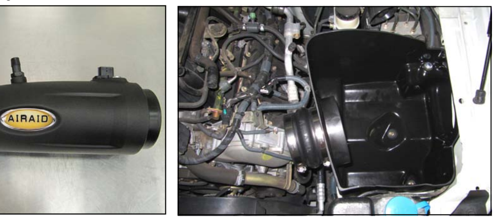
9. Slide the Hump Hose (#6) and #72 Hose Clamps (#20) onto the Filter Adapter. Leave the clamps loose for now.

align the bolt holes, and secure using the OEM hardware.