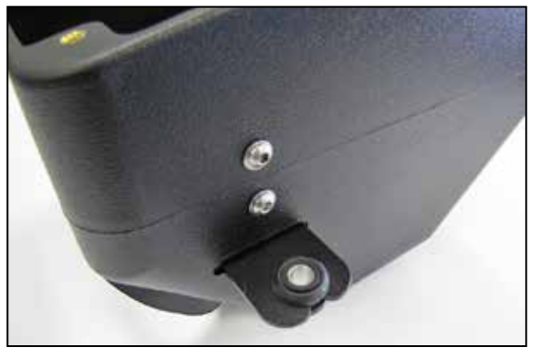
8. Install the grommet and sleeve from the previous step into the provided mounting bracket, then install the mounting bracket through the AIRAID® air filter housing and secure with the provided hardware.