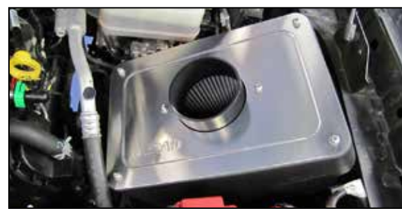
12. Install the lid assembly onto the AIRAID® air filter housing and secure with the provided hardware.