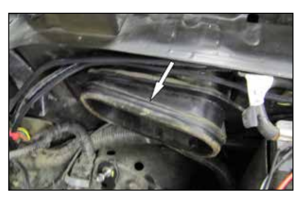
5. Remove the gasket from the factory fresh air intake.

NOTE: This bolt will be reused in a later step.