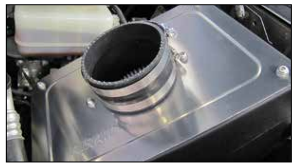
13. Install the provided step coupler onto the filter adapter and secure with the provided hose clamp.