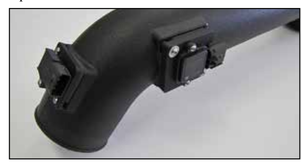
17. Install the sensor assemblies into the AIRAID® intake tube and secure with the provided hardware. NOTE: Be sure the mass air sensor is installed in the correct direction.