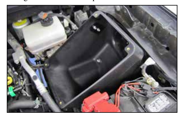
9. Install the AIRAID® air filter housing onto the mounting studs on the inner fender and secure with the factory bolt removed in step #4.