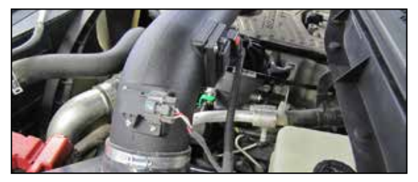
19. Reconnect the mass air and temperature sensor electrical connections.