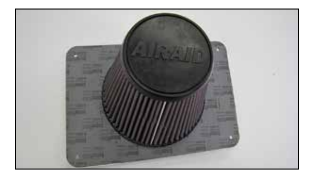
11. Place the housing lid gasket onto the lid and then install the AIRAID® air filter and secure with the provided hose clamp.