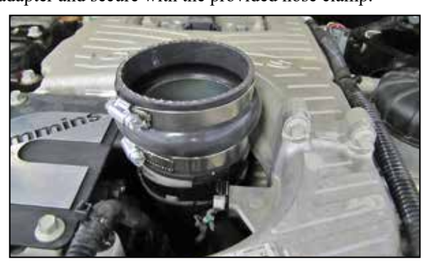
14. Install the provided hump coupler onto the turbo inlet and secure with the provided hose clamp.