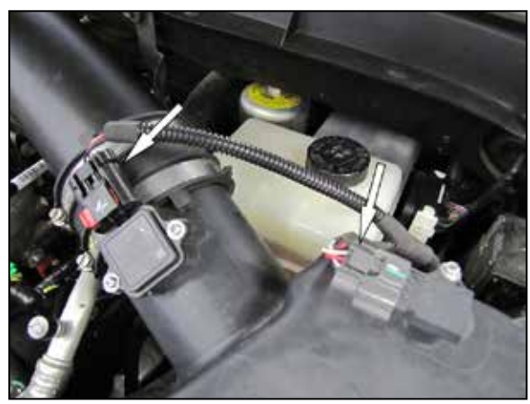
2. Disconnect the mass air sensor and inlet air temperature sensor electrical connections.

NOTE: Disconnecting the negative battery cable erases pre-programmed electronic memories. Write down all memory settings before disconnecting the negative battery cable. Some radios will require an anti-theft code to be entered after the battery is reconnected. The anti-theft code is typically supplied with your owner's manual. In the event your vehicles anti-theft code cannot be recovered, contact an authorized dealership to obtain your vehicles anti-theft code.