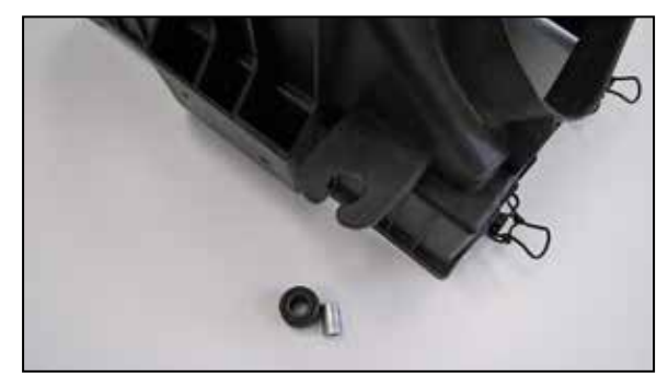
7. Remove the factory grommet and sleeve from the factory lower air filter housing.