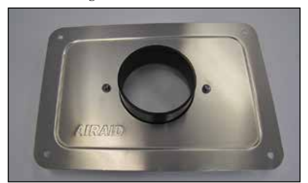
10. Install the filter adapter onto the air filter housing lid and secure with the provided hardware.