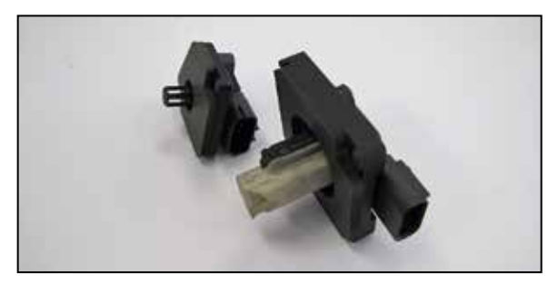
16. Install the factory sensors into the provided sensor adapters and then install the provided gaskets onto the adapters.