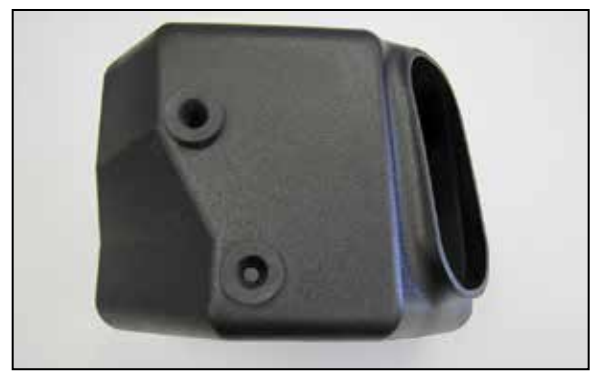
6. Remove the two mounting grommets from the factory lower air filter housing and install them into the AIRAID® housing as shown.