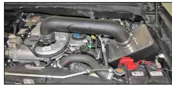
20. Double check your work!

Make sure there is no foreign material in the intake path. Make sure all clamps, hoses, bolts, and screws are tight. Double check the hood clearance!