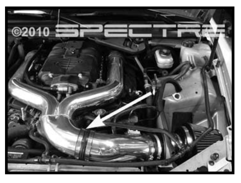
Step 12 Position the intake tube assembly coupler on the Spectre "Y" tube and tighten the clamp.