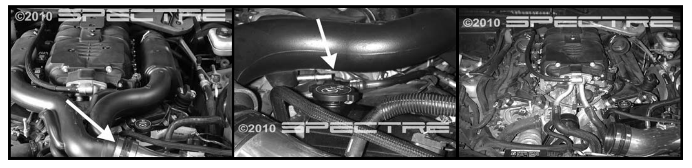
Step 5 Loosen the clamp on the Spectre intake tube. Lift the factory intake tube slightly so that the coupler comes off. Move the tab on the plastic vent tube so that it will slide off the nipple. Lift the entire factory "Y" intake tube off the engine.