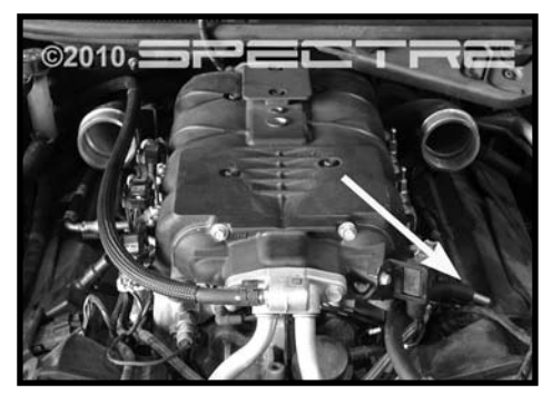
Step 8 Install the supplied vent hose as shown on the valve cover nipple.