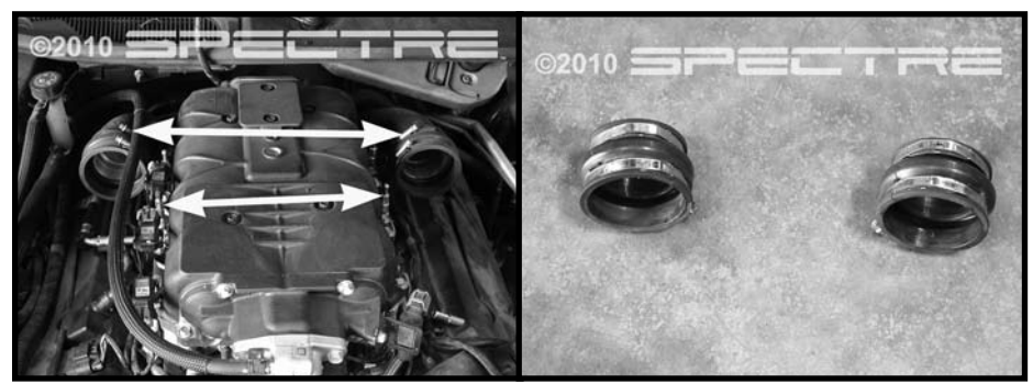
Step 7 Install the two middle engine cover nuts (removed in Step 4) as shown. Loosen the clamps on the intake tube couplers. Remove the couplers and set them aside as they will be reused in a later step.