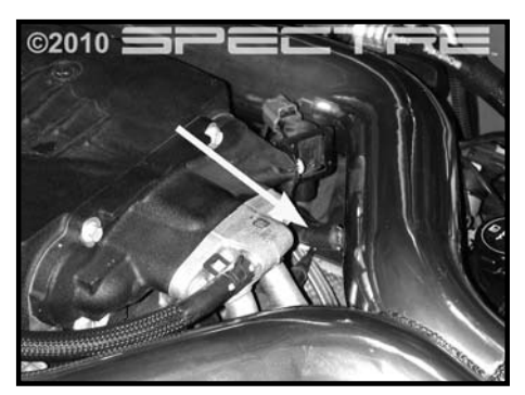
Step 11 Install the vent hose on the intake tube.