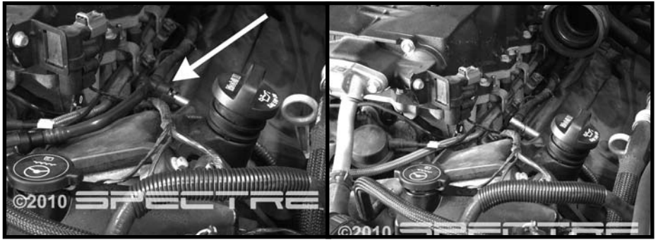
Step 6 Press the tab down and remove the vent hose.