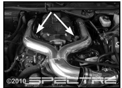
Step 10 Position the intake tube so the couplers slide over the rear intake tubes. Lower the intake tube so the mounting tabs go over the factory mounting studs. Loosen the clamps on the couplers. Adjust the couplers so they are positioned in the factory groove on the rear manifold inlets and fully tighten the clamps. Install the 2 remaining engine cover nuts (removed in step 4) on the studs to secure the intake tube.