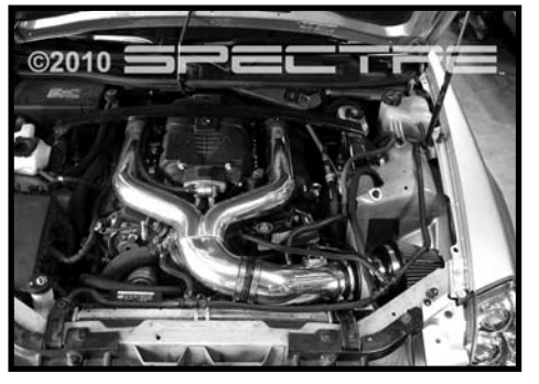
Step 13 Reinstall the strut tower brace with the 6 nuts and bolts that were removed in step 2. Torque the nuts and bolts to the manufacturer specifications of 80 ft. lbs. Note: To install the factory engine cover it must be modified to clear the larger intake tube.

Step 14 Make sure that all clamps and hardware are fully tightened. Reconnect the battery cable, start the vehicle and let it warm up. Shut off and inspect the installation once more for any loose clamps, wires, or hardware. Test drive & enjoy! Your installation is now complete. Periodically check all clamps and brackets.