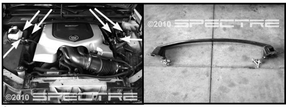
Step 2 Use an 18mm socket to remove the 6 nuts and bolts that secure the strut tower brace. Use caution as these nuts and bolts are very tight. Set the brace with the nuts and bolts aside as it will be reinstalled in a later step.