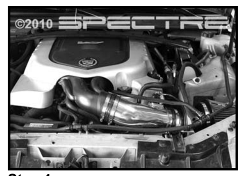
Step 1 Safety first! Before you begin the installation, make sure that the vehicle is in park or neutral (for vehicles equipped with a manual transmission) with the parking brake set. Disconnect the negative battery terminal and verify all comp onents listed are present. Note: This intake kit is the Stage II kit for the Spectre Performance P/N 9917 Cold Air Intake Kit. It cannot be installed without also installing P/N 9917. Refer to P/N 9917 installation instructions to install the lower intake tube, heat shield and filter assembly shown in the picture below.