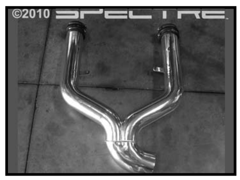
Step 9 Install the factory intake tube couplers (removed in Step 7) onto couplers slide over the rear the Spectre intake tube. Snug the clamps, but do not fully tighten at this time as they will need to be adjusted in another step. Step 10 Position the intake tube so to couplers slide over the rear intake tubes. Lower the intake tube so the mounting tabs go over the factory mounting studs. Loosen the clamps