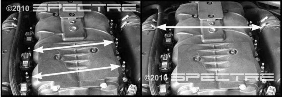
Step 4 Remove the four 10mm engine cover nuts that secure the upper intake plenum. Set these nuts aside as they will be used in a later step. Loosen the two clamps on the intake couplers at the rear of the factory "Y" tube.